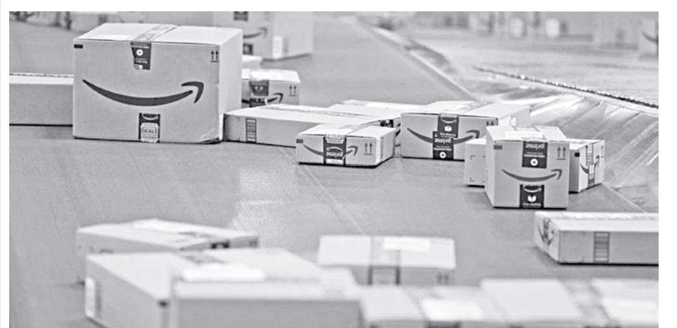
Packages emblazoned with Amazon logos travel along a conveyor belt inside an Amazon fulfillment centre in Robbinsville, New Jersey, US.