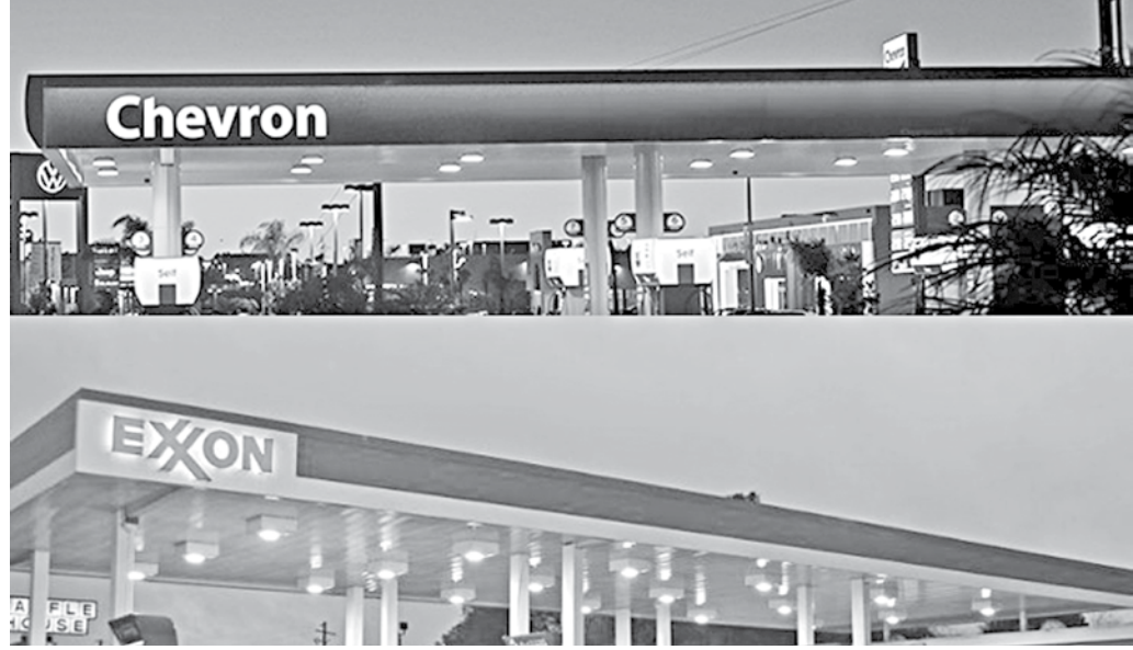
ExxonMobil said it would keep its 2021 capital spending budget at the low end of projections, while Chevron highlighted its lower spending in the second quarter.