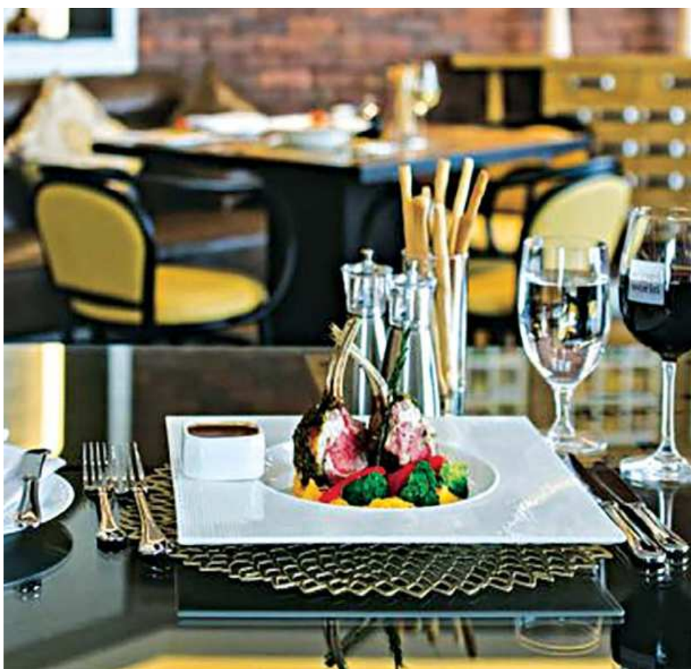
This is a representational image from The Daily Star's Lifestyle's archive and has no resemblance/connection (fictional or otherwise) with the story

As I watched in awe at the perfect balance of self-awareness and lack thereof I too found myself caught in their ways. Why, of course, I would sell my kidney for their risotto, and