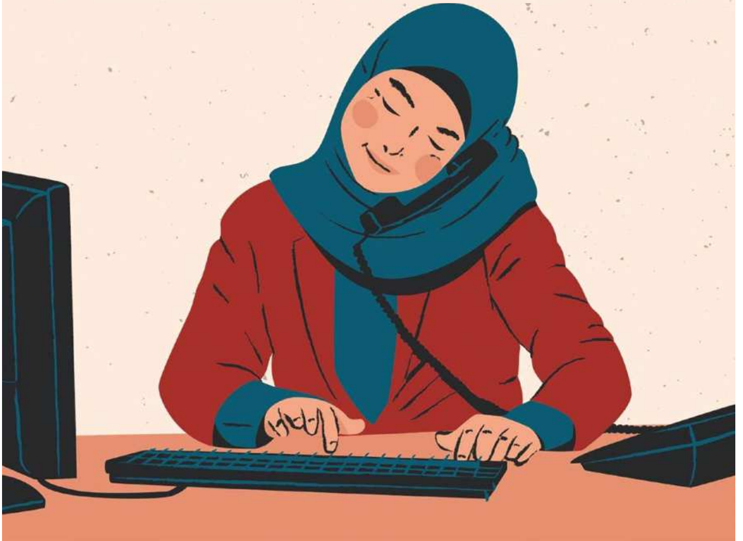
ILLUSTRATION: ZARIF FAIAZ

Essential skills for budding researchers Page 3