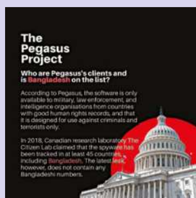
ILLUSTRATION: ZARIF FAIAZ