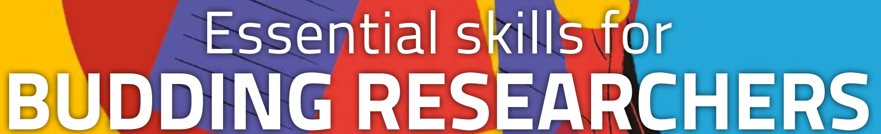
ILLUSTRATION: ZARIF FAIAZ