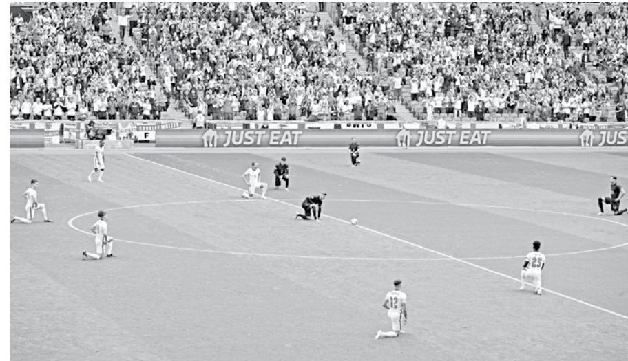
Players take a knee in support of the Black Lives Matter movement before the Euro 2020 match round of 16 between England and Germany at Wembley stadium in London, June 29, 2021.

attitude towards benefits of diversity and multiculturalism, and media outlets including those xenophobic tabloids, all in unison supported the English team. Prime Minister Boris Johnson, much criticised for his offensive comments about women, ethnic minorities and gay people and for refusing to condemn those spectators who booed footballers for taking the knee, started his day, the night after, with a tweet: “This England team deserve to be lauded as heroes, not racially abused on social media. Those responsible for this appalling abuse should be ashamed of themselves.” Home Secretary Priti Patel, who termed the knee-taking as “gesture politics”, also expressed her disgust and promised actions against the social media onslaught.