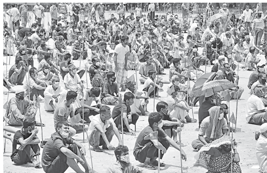
People wait at a playground in the capital’s Siddheswari area to receive food and cash assistance amid the lockdown, on July 8, 2021.

There is an urgent need for more institutionalised efforts to create alternative livelihood provisions, particularly for the urban informal workers.