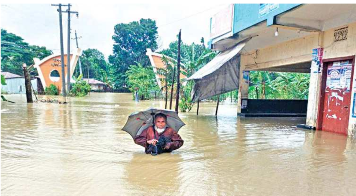
A man wades through over waist-deep water in Lama-Gajalia Bus Stand area of Bandarban's Lama upazila yesterday. Low-lying areas of the upazila were inundated after it rained heavily for the last few days, causing public sufferings. Locals said a poor drainage system was mainly to blame.