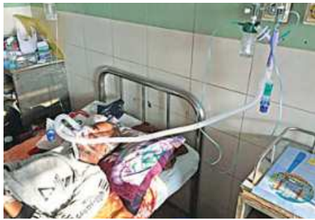
"A rough-edged black box with a plastic tube coming out of it, and a small LCD screen -- this could be the lifesaving ventilator for critical Covid-19 patients in the imminent future" is how this very newspaper had described Spondon.

Take Spondon for example. In April last year, when the pandemic had just begun, a team of innovators from Axion Engineering domestically produced a ventilator that would cost a fraction of the price of regular ventilators and be affordable for resource-strapped hospitals.