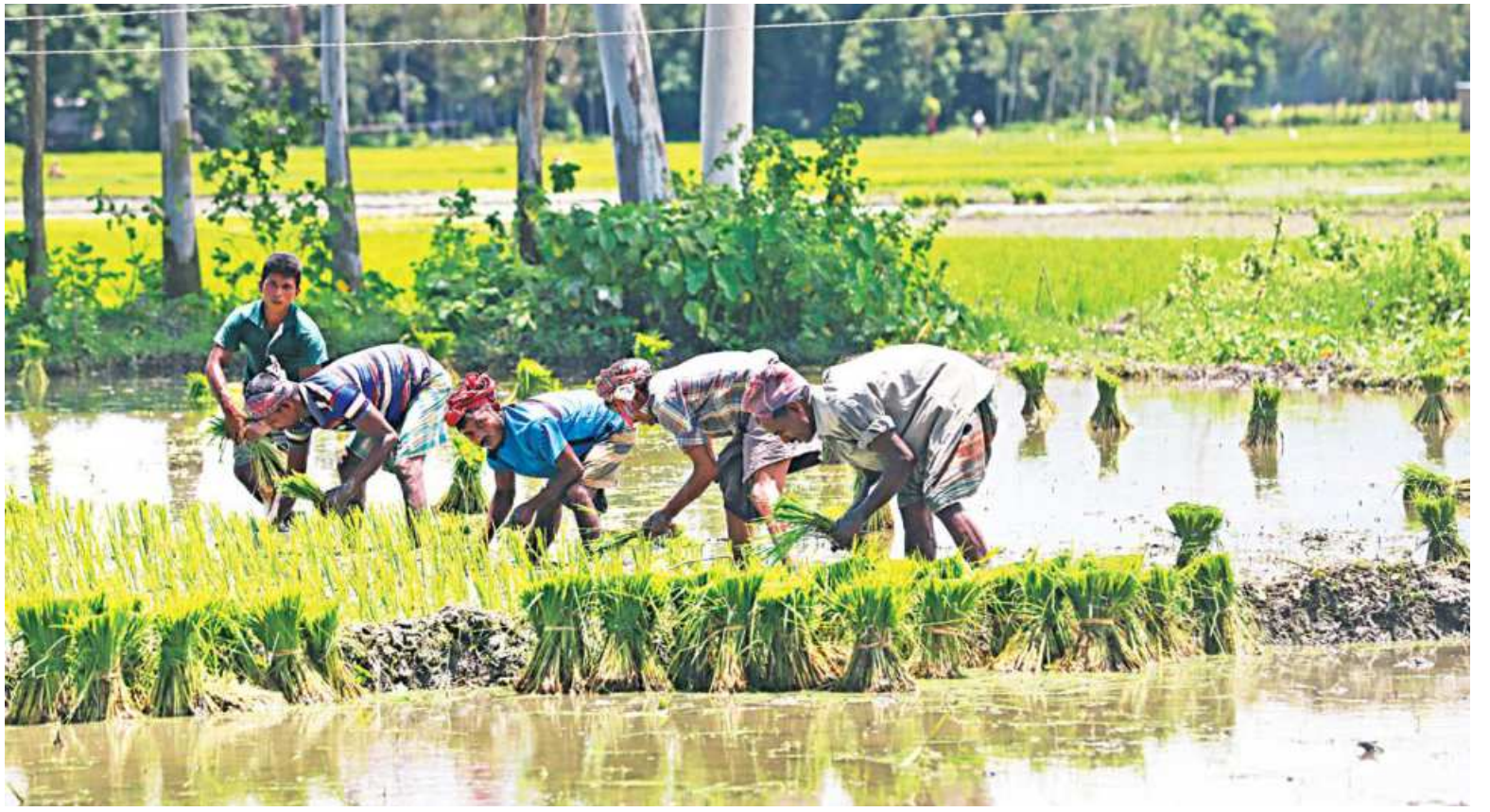
Bangladesh Bank has increased the farm loan disbursement target to Tk 28,391 crore this fiscal year in a bid to help farmers combat the adverse impacts of the pandemic.