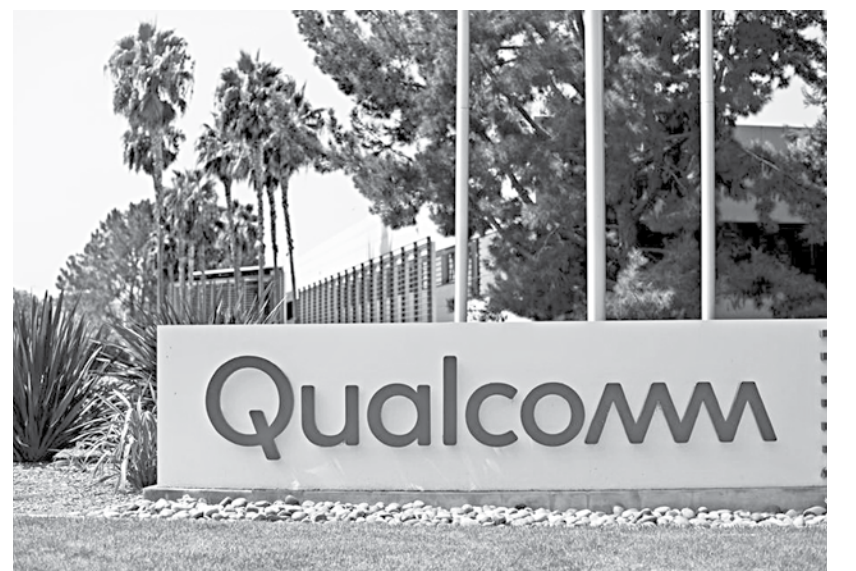
A Qualcomm sign is seen outside one of the company's many buildings in San Diego, California, US.

That means that phone makers are likely directing any chips that are in short supply toward production of their more profitable 5G devices. Apple shares rose 0.14 per cent in after-hours trading after Qualcomm's results.