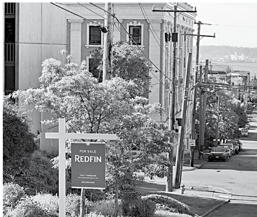
A 'For Sale' sign is posted outside a residential home in the Queen Anne neighborhood of Seattle, Washington, US on May 14.

The average contract interest rate for traditional 30-year mortgages declined to 3.01 per cent - its lowest level since February - in the week ended July 23.