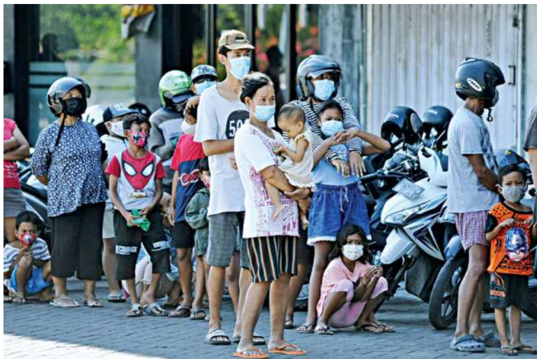
People wearing protective masks stand in line to receive free meal amid a surge of coronavirus disease cases in Bali, Indonesia yesterday.

Sinabung, a 2,460-metre (8,070-foot) volcano, was dormant for centuries before roaring back to life in 2010 when an eruption killed two people.