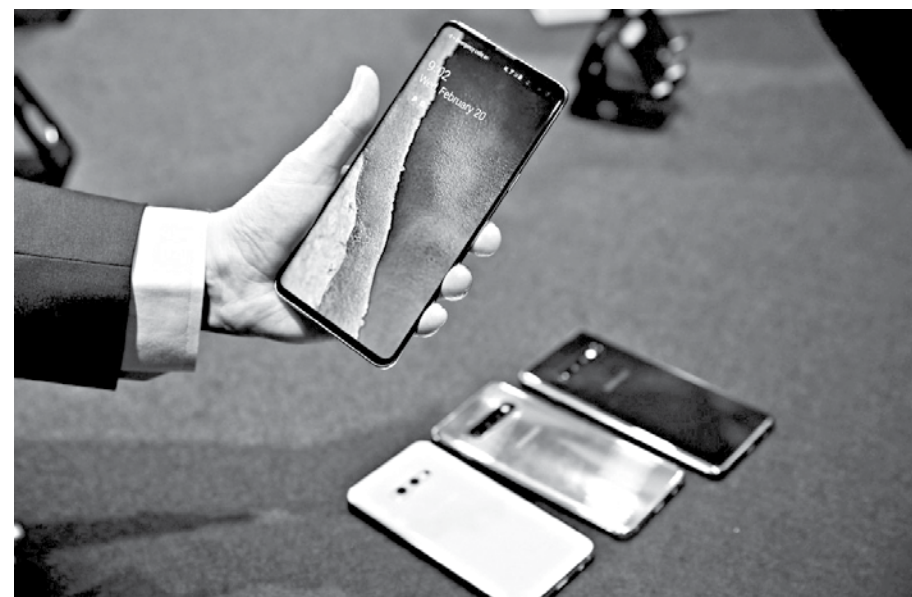
The more brands lean towards local factories, the more affordable smartphones will be.

smart devices in this country, but it is often seen that people from all walks of life struggle to buy the right phone because of the relatively high prices. This is why it is important that mobile brands manufacture their devices locally so that they can offer smartphones at more competitive prices. It is, however, heartening to see that many smartphone manufacturers have opted for local production, thanks to the time-befitting