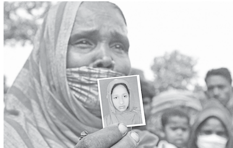
An elderly woman showing her daughter's photo who's missing since the fire broke out at Hashem Food and Beverage Factory in Narayanganj's Rugganj.