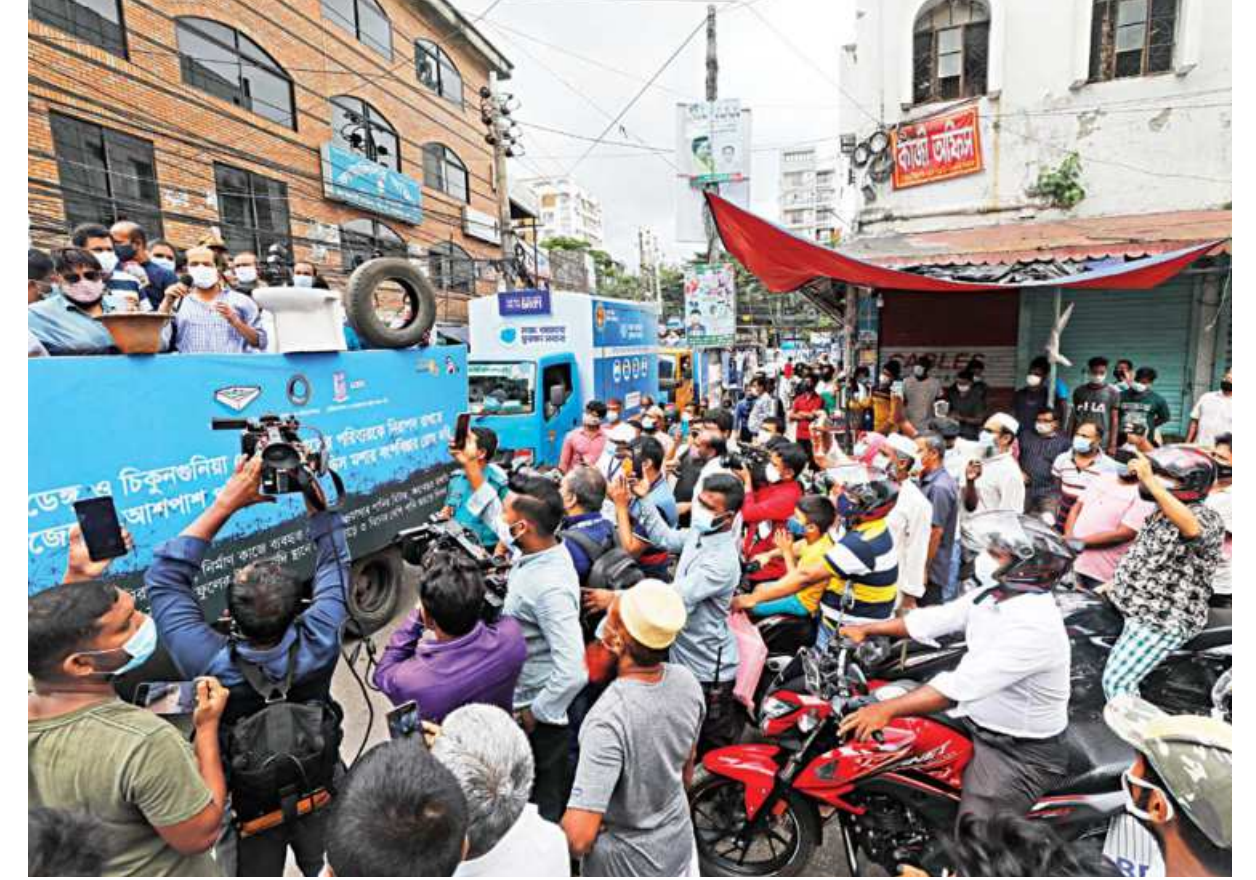
Mayor Atiqul Islam inaugurated DNCC's anti-dengue and chikungunya drive at Mohammadpur Town Hall area yesterday, with the aim to contain the potential public health hazard the mosquito-carried diseases pose. However, in the process, the gathering of people for the inauguration compromised the more pressing health hazard of the Covid-19 pandemic.