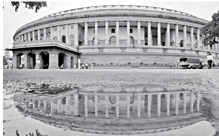
Sustained anti-government protests by the opposition on the floor of the House paralysed almost the entire first week of the monsoon session of Parliament in India, pictured here.

The Pegasus issue has once again brought to the fore the demand for bringing intelligence agencies under legislative or judicial oversight, something no political executive, irrespective of affiliation, has done so far.