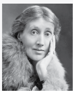
VIRGINIA WOOLF (1882-1941) English writer

The history of men's opposition to women's emancipation is more interesting perhaps than the story of that emancipation itself.