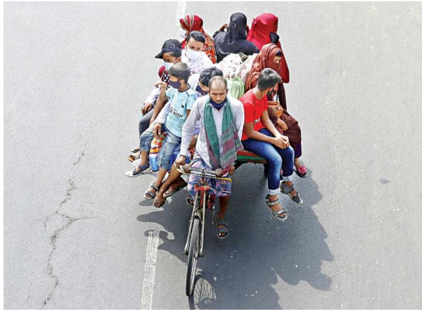
Nine people, crammed on a single cycle-van, head towards Dhaka from Narayanganj after Eid holidays, due to a lack of public transport. Police seemed to look the other way even though traveling restrictions were imposed by the government to curb the spread of coronavirus. The photo was taken at Kadamtali on the Dhaka-Chittagong highway.