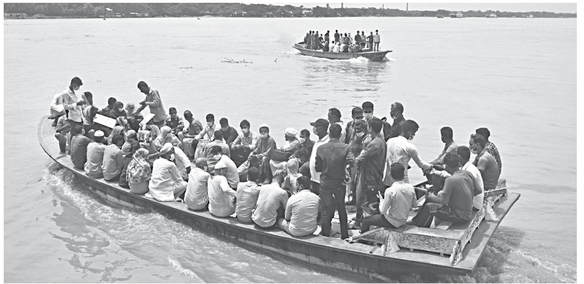
Trawlers flood their vessels with passengers and carry them through Kirtankhola River in Barishal, showing no care for lockdown restrictions. This photo was taken on Sunday from Barishal River Port Terminal.