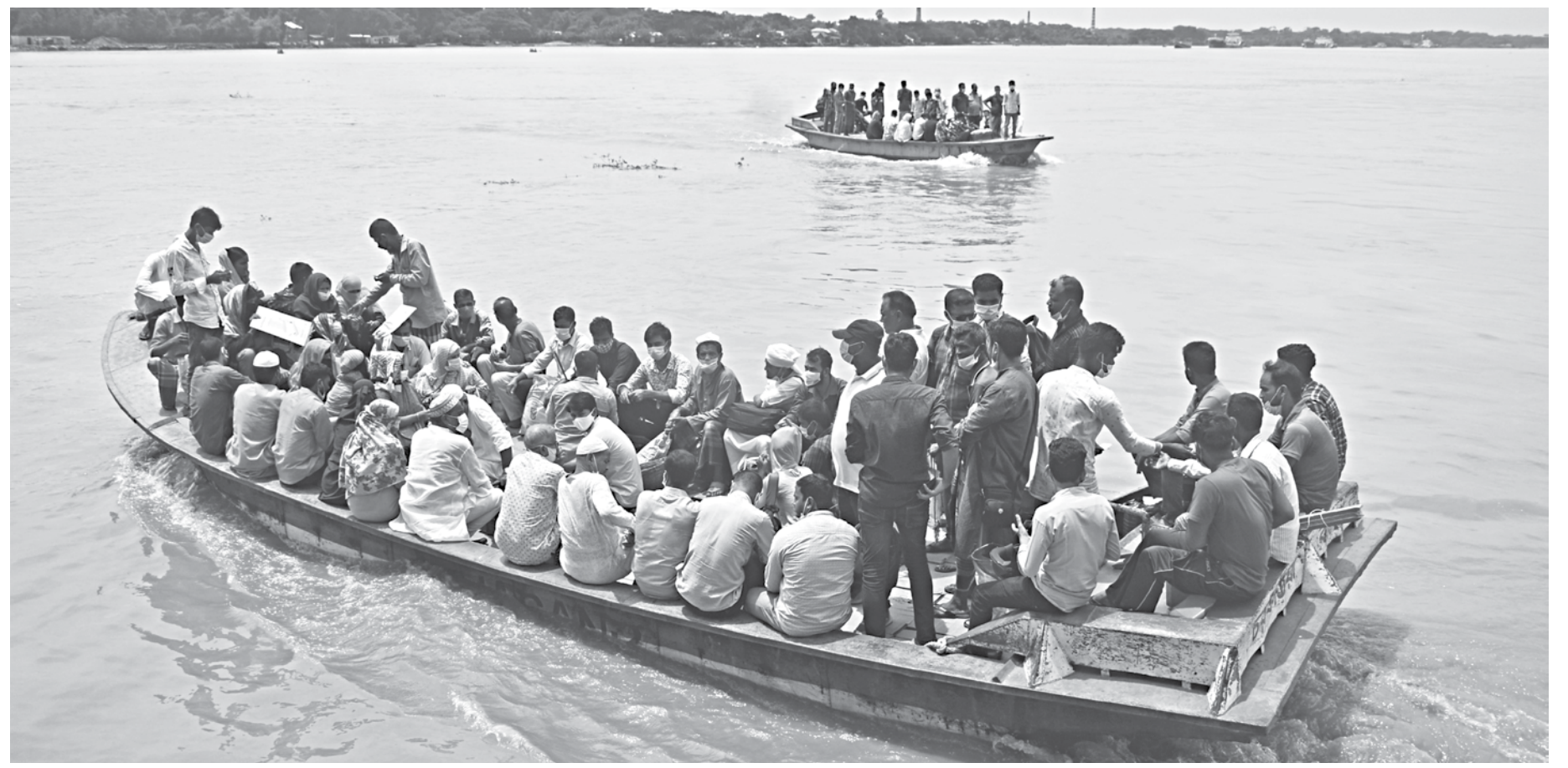
Trawlers flood their vessels with passengers and carry them through Kirtankhola River in Barishal, showing no care for lockdown restrictions. This photo was taken on Sunday from Barishal River Port Terminal.

The detainee will be handed over to Customs, and filing of a case against him under Money Laundering Prevention Act is underway.