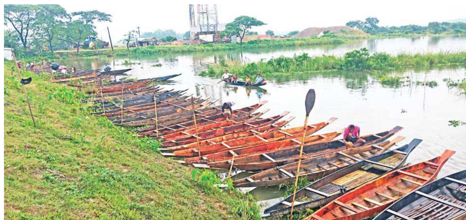
Boats lined up for sale at Salutikor Bazar in Gowainghat upazila of Sylhet district. Sellers from far and near congregate every Saturday and Tuesday with vessels priced in the range of Tk 3,000 to Tk 8,000. Out of around 500 put on display, some 300 get sold each day, especially during the monsoon. This is because boats are the sole mode for transportation in haor areas of Sylhet's Gowainghat, Compangany, Sylhet Sadar, Bishwanath and Sunamganj's Chhatak upazilas. The photo was taken recently.