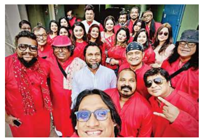
After a project with Gaan Bangla Television. The artiste always wore a smile while interacting with others.