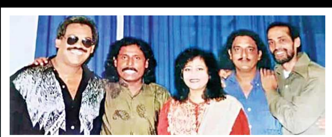
(From left) Ferdous Wahid, Fakir Alamqir, Pilu Momtaz, Firoze Shai and Azam Khan. The artistes were not only legendary in their own genres of music, but were also great friends.