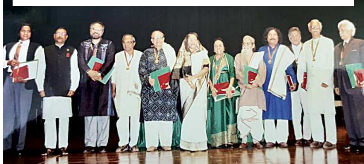
While receiving the coveted Ekushey Padak, with Prime Minister Sheikh Hasina.