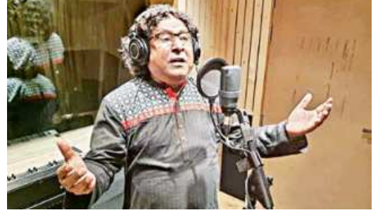
During a recording session.