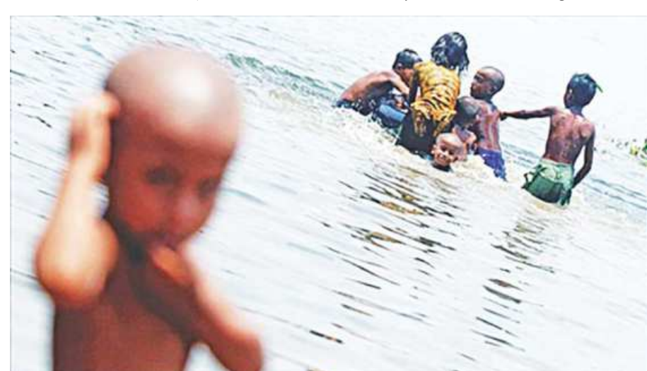
The WHO estimates that drowning is the cause of 236,000 deaths every year.

of the Directorate General of Health Services and Unicef-Bangladesh. BHIS 2016 estimated that about 19,000 people of all ages die due to drowning each year. Over three quarters of these deaths, approximately 14,500, occur in children under 18. In other words, each day about 40 children die from drowning in Bangladesh. When children under 5 years are considered, this number is 30 a day, about 10,000 per year. The survey also identified wide exposure to water bodies, lack of awareness, lack of supervision of young children, lack of swimming skills of children and first response skills of communities were the major risk factors