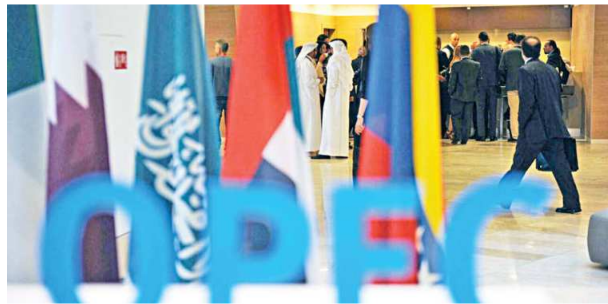
In early July, the world was abuzz when the oil-producing cartel, known as OPEC Plus, failed to agree on a production plan.

In early July, the world was abuzz when the oil-producing cartel, known as OPEC Plus, failed to agree on a production plan, and crude oil prices soared to a record high in the trading markets. Then, within a week in mid-July, the EU announced new measures to curb carbon emissions and to force its trading partners to do the same. EU is attempting to streamline its existing carbon-taxes