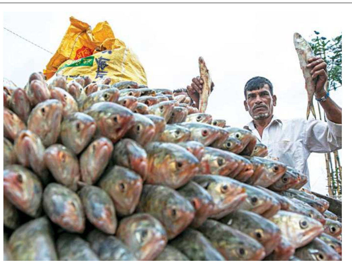
Fishers across the country have ventured out with their net after the 65-day long ban on catching Hilsa at sea ended on Friday. Although the first two days saw a depression at the Bay of Bengal, anglers are hoping their fortunes will recover soon. These photos were taken yesterday from Chattogram city's Fishery Ghat area.