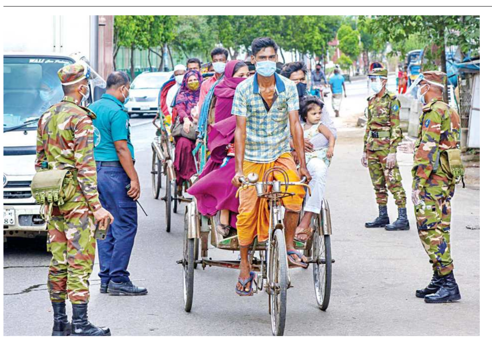
Army and police personnel inspect city dwellers who have ventured out near the capital's Bangshal yesterday. On the first day of a "strict lockdown" to curb the spread of Covid-19, law enforcers all over the capital were making sure that none were leaving home without valid reasons.