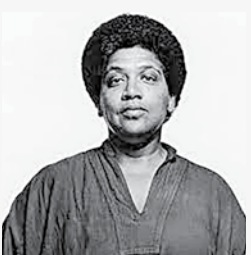
AUDRE LORDE (1934-1992) American writer

When we speak we are afraid our words will not be heard or welcomed. But when we are silent, we are still afraid. So it is better to speak.