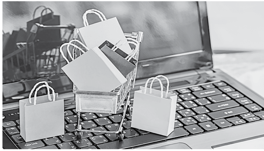
Projections show that in the next five years the size of the resale market will be reaching somewhere between USD 65 billion and USD 75 billion.

it "supersonic growth" as they claim that it is 11-time faster than the broader clothing retail sector. Projections show that in the next five years the size of the resale market will be reaching somewhere between USD 65 billion and USD 75 billion. One of the largest online resale platforms thredUP says