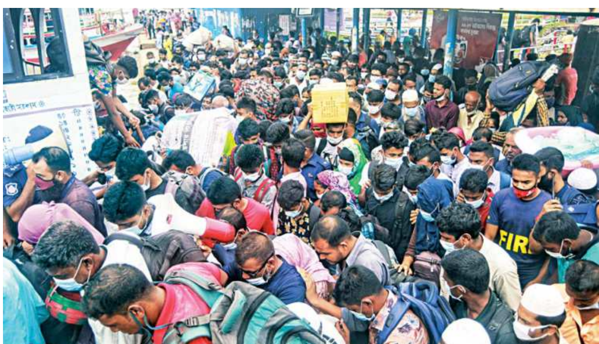
Ignoring physical distancing, home-goers stream into a launch to cross the Padma as soon as the vessel reached the Shimulia Ghat in Munshiganj's Louhajang upazila around 9:30am yesterday. The rush of people leaving the capital for their village homes reached its peak yesterday with Eid tomorrow.