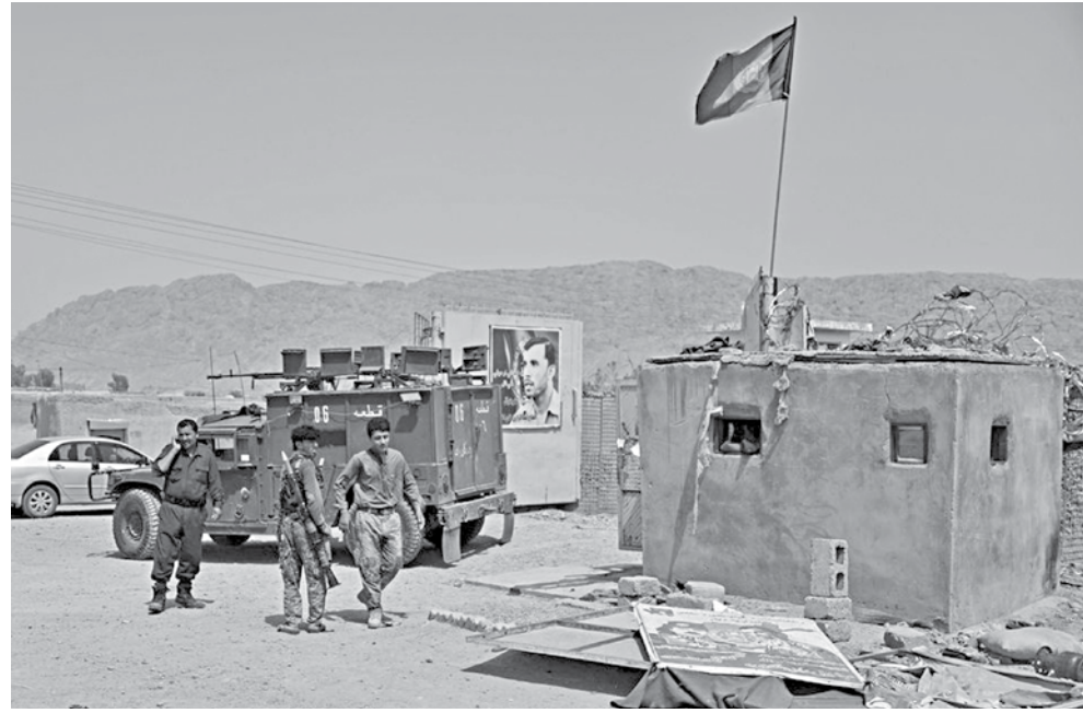
Afghan security forces inspect the site of a car bomb attack in Kandahar province, Afghanistan, July 6, 2021.