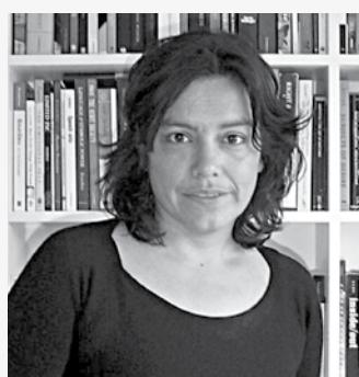
SARA AHMED British-Australian scholar (born August 30, 1969)

A system is working when an attempt to transform that system is blocked.