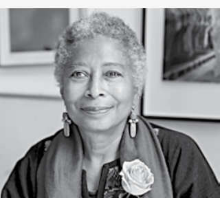
ALICE WALKER (1944)