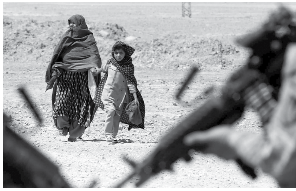
An Afghan woman and girl approach American troops in Kandahar.

In these past 20 years, girls and women had been allowed access to education, access to healthcare, access to income generating opportunities, among other facilities. For the suppressed women of Afghanistan these are privileges; things that we are lucky to be able to take for granted.