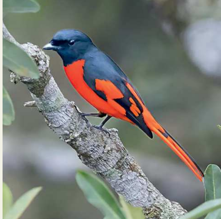
Scarlet Minivet, Bangladesh.

almost identical to the Scarlet Minivet except for a longer tail. It is rare in Bangladesh.