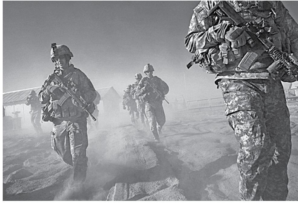
While the US leaves Afghanistan red-faced, it still cannot admit fully that it has lost the war in Afghanistan'

Meanwhile, a cliff-hanger is set for the end of July, as the Taliban announced they will submit a written peace proposal to Kabul, which ultimately may amount to an