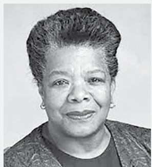
MAYA ANGELOU American poet and civil rights activist (1928 – 2014)

You can't use up creativity. The more you use, the more you have.