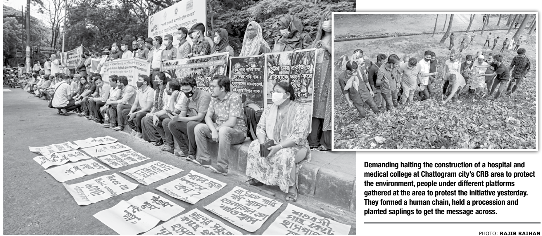
Demanding halting the construction of a hospital and medical college at Chattogram city's CRB area to protect the environment, people under different platforms gathered at the area to protest the initiative yesterday. They formed a human chain, held a procession and planted saplings to get the message across.

On July 12 and February 24, law enforcers arrested three persons with 975 grammes of meth and two persons with 140 grammes of meth from Patharghata and Khulshi areas respectively.