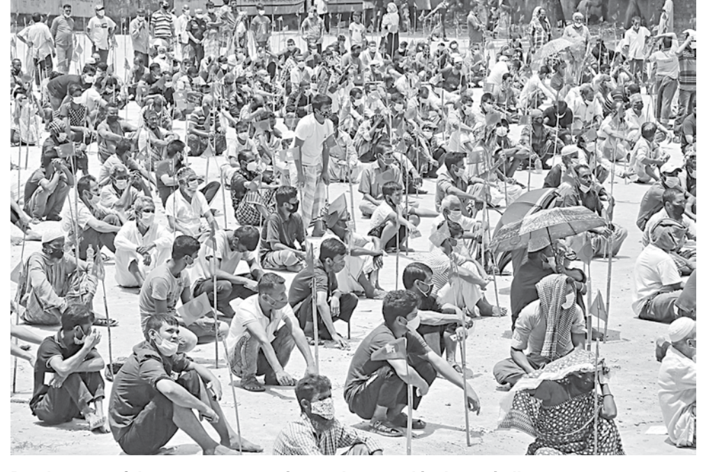
People, many of them young men, wait at a playground in the capital's Siddheswari area to receive help amid the ongoing lockdown to curb Covid-19 transmission, on July 8, 2021.

Nearly one-third of the country's population is aged 18-35. These millions of youth could become a demographic dividend in the country's journey towards the SDGs, only if we can provide them with the correct resources and access to opportunities.