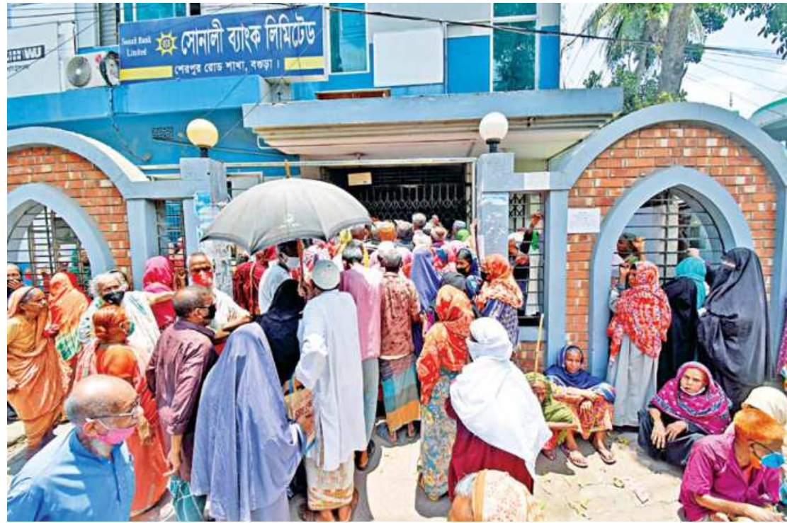
Elderly people queue before Sonali Bank's Sherpur Road branch in Bogra for "old-age allowance".