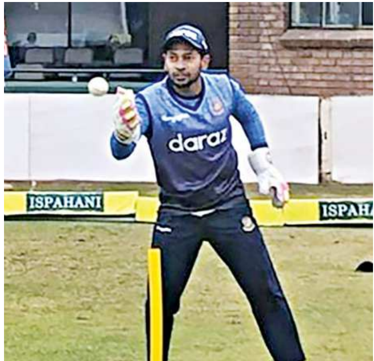
Wicketkeeper batsman Mushfiqur Rahim tries to catch a ball during practice yesterday in Harare. Mushfiqur has reportedly made himself available for the T20 series against Zimbabwe, retreating from his previous position of skipping the shortest format during the tour.

After those losses, Bangladesh left for Zimbabwe and registered a comprehensive 220-run win in the lone Test, presumably bolstering confidence ahead of a three-match