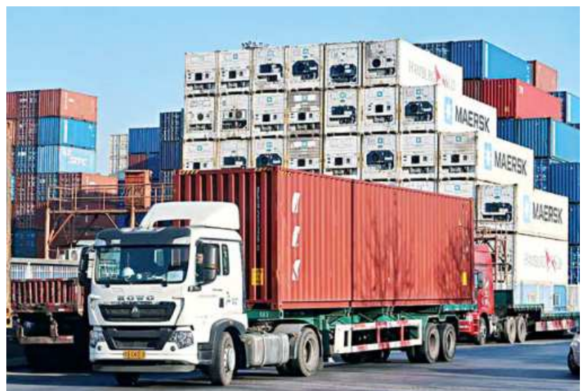
A worker drives a truck carrying a container at a logistics centre near Tianjin port, in Tianjin, China.

Germany, for example, which was at first sluggish in its vaccination drive, said this month it had caught up with the United States in terms of the proportion of the population having had one shot of Covid-19 vaccine.