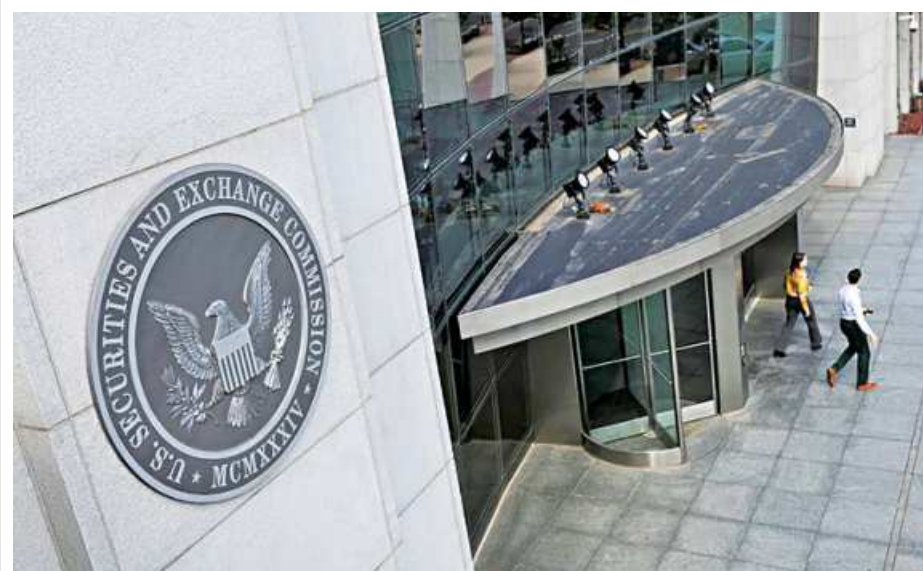
People exit the headquarters of the US Securities and Exchange Commission in Washington, DC, US on May 12.

Critics say such arrangements could incentivise banks to talk up targets or play down potential problems, which could harm investors if the target company's earnings underperform, or other regulatory or legal issues emerge following the merger.