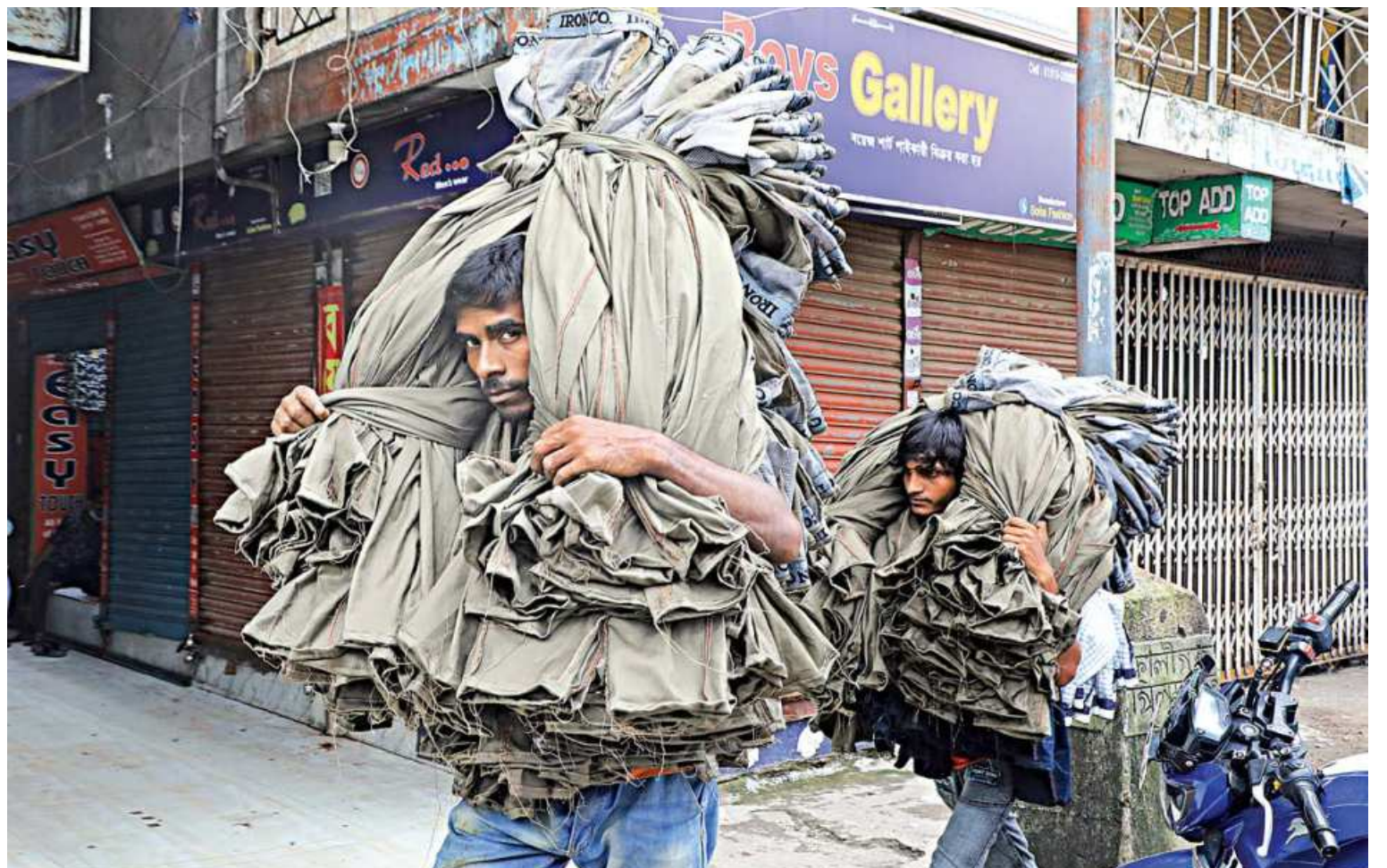
Semi-finished jeans being stocked at Alam Market in Keraniganj with traders hoping that the relaxation of lockdown restrictions prior to the upcoming Eid-ul-Azha would help them log some sales. The photo was taken recently.