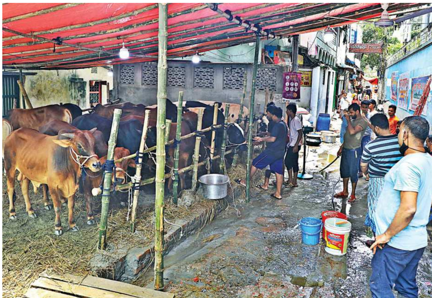
People have set up a cattle market in the capital's Bangla Motor area ahead of Eid-ul-Azha, despite government restrictions due to the Covid-19 pandemic. The photo was taken yesterday afternoon.