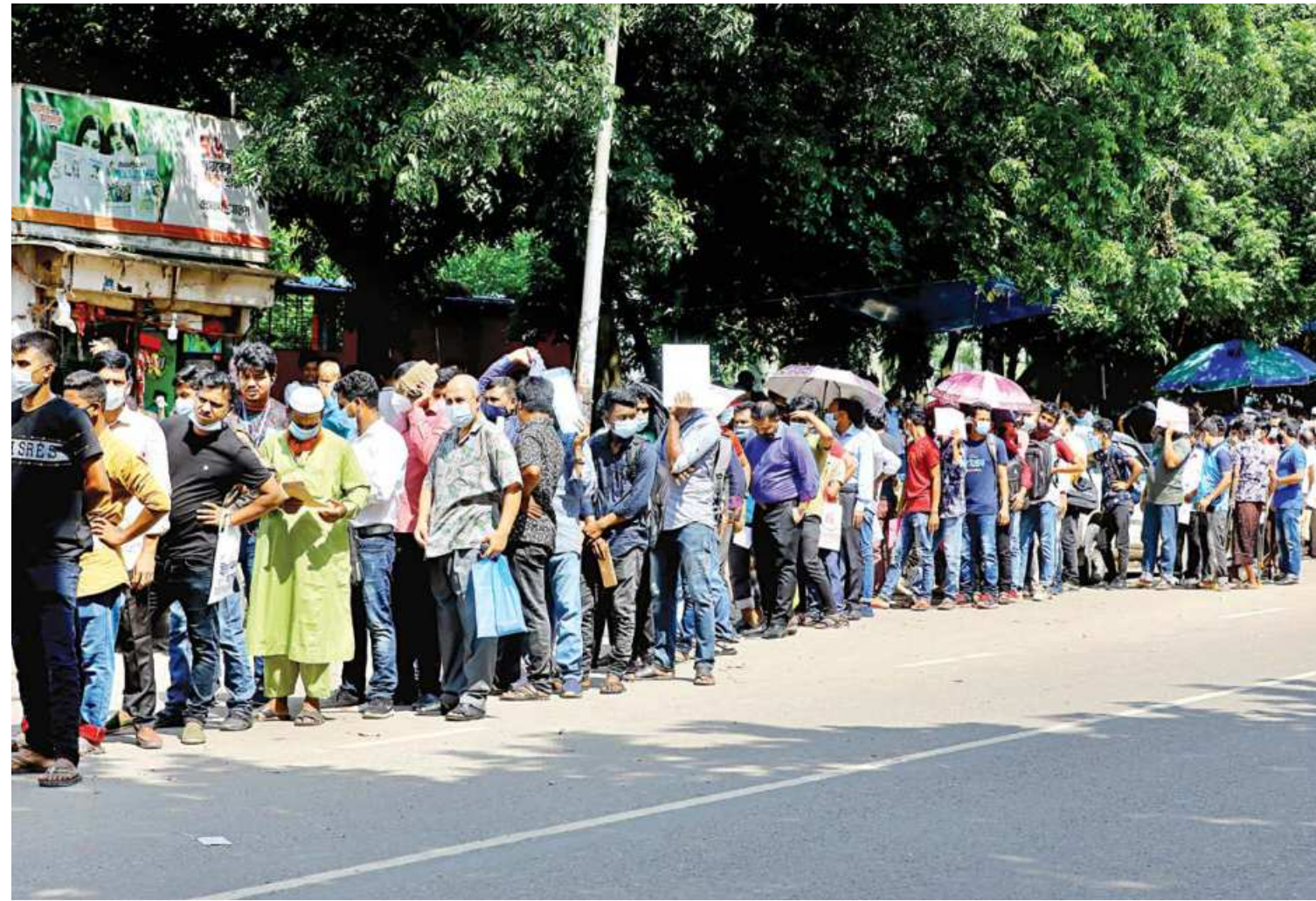
Expatriate workers, waiting to get vaccinated, stand in a long queue in front of the capital's Dhaka Medical College Hospital yesterday. The line went as far as the Central Shaheed Minar. The photo was taken around noon.