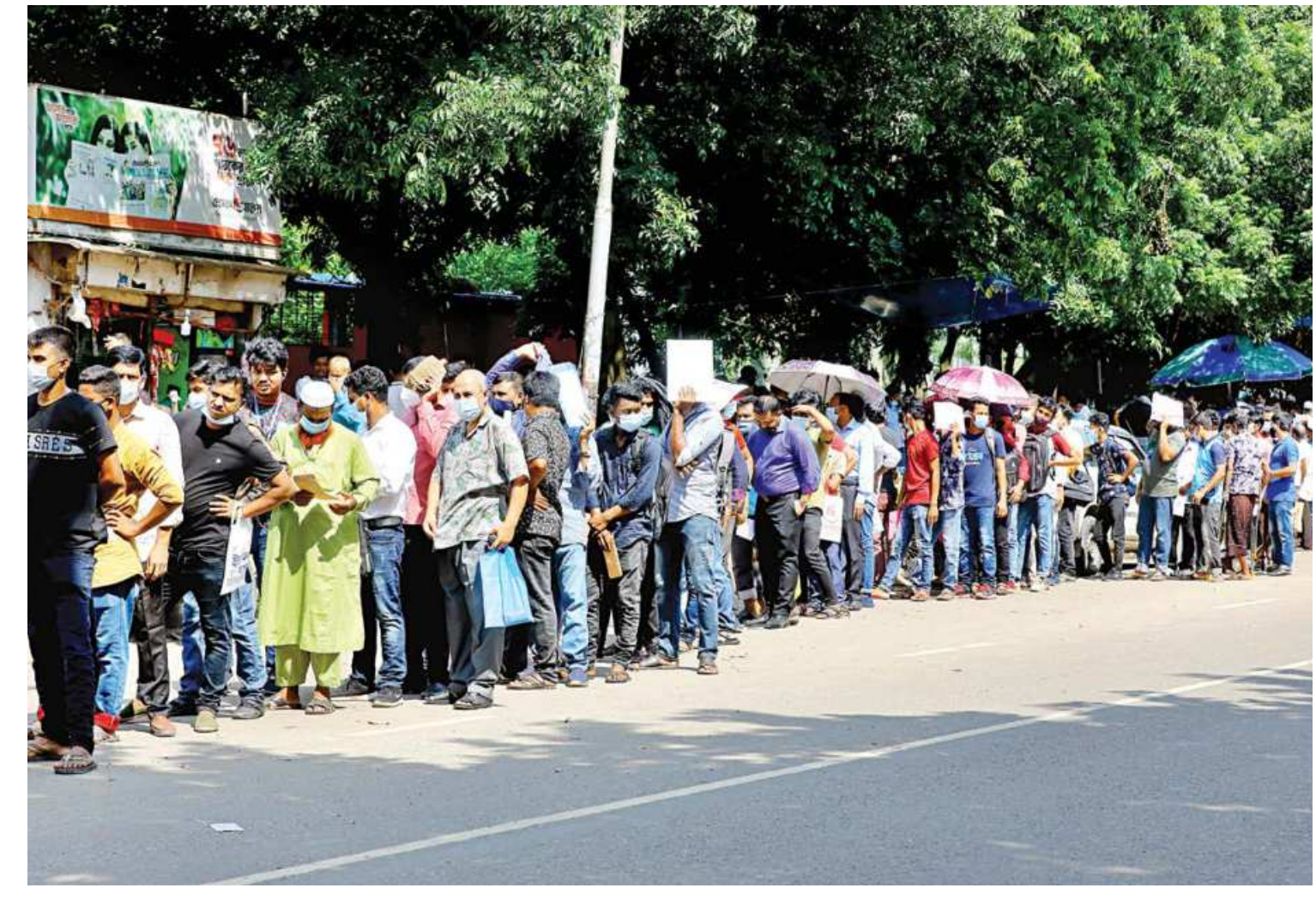
Expatriate workers, waiting to get vaccinated, stand in a long queue in front of the capital's Dhaka Medical College Hospital yesterday. The line went as far as the Central Shaheed Minar. The photo was taken around noon.

Although it is a well-known strategy of mainstream JMB to raise funds for militant activities, Osama adopted the tactics to collect funds for Neo JMB, said investigators. SEE PAGE 10 COL 2