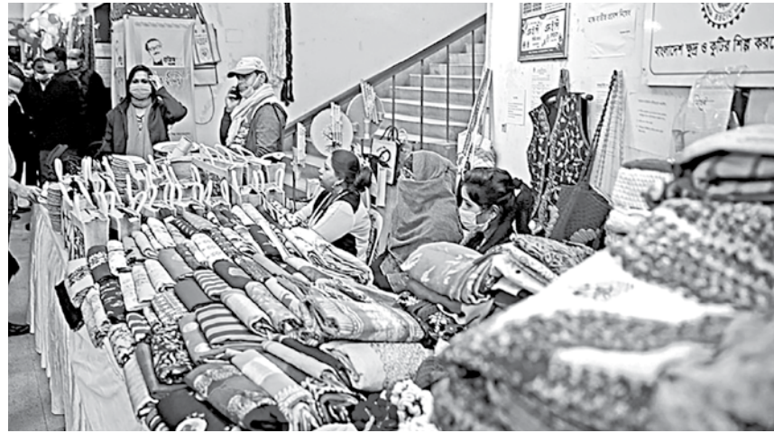
Across all regions, women lost jobs at a greater rate than men in 2020, as they took on an average of 30 more hours of childcare per week.

When women are not at the table, the consequences are serious. This pandemic has led to increases in domestic violence and suspensions or delays in sexual and reproductive health services, often leaving