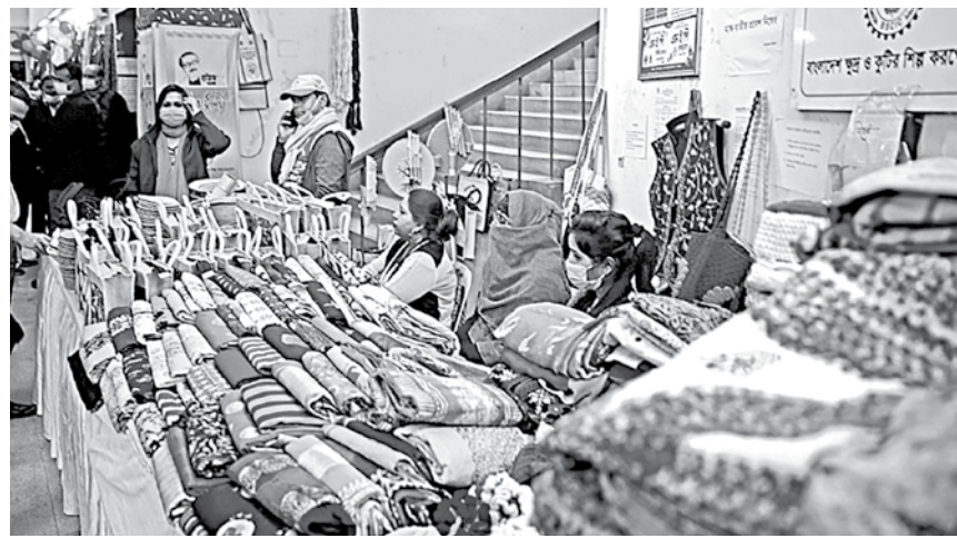
Across all regions, women lost jobs at a greater rate than men in 2020, as they took on an average of 30 more hours of childcare per week.

When women are not at the table, the consequences are serious. This pandemic has led to increases in domestic violence and suspensions or delays in sexual and reproductive health services, often leaving