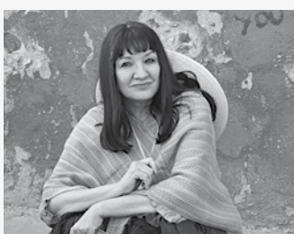
SANDRA CISNEROS American writer (1954)

Revenge only engenders violence, not clarity and true peace. I think liberation must come from within.