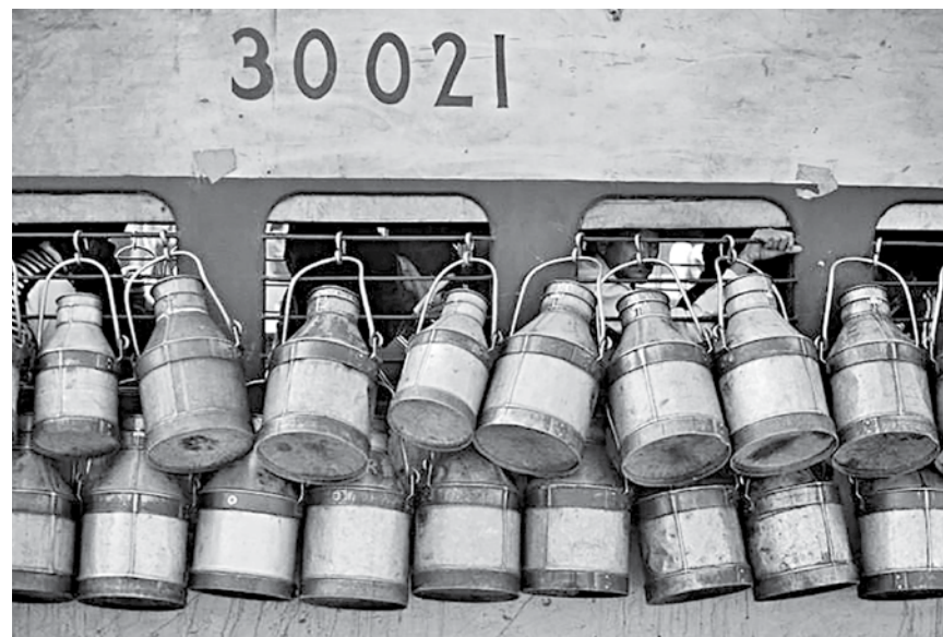
India has 194,195 cooperative societies in the dairy sector and 35 percent of India's sugar comes from cooperative sugar mills.

Pradesh, where 80 seats are up for grabs in general elections.