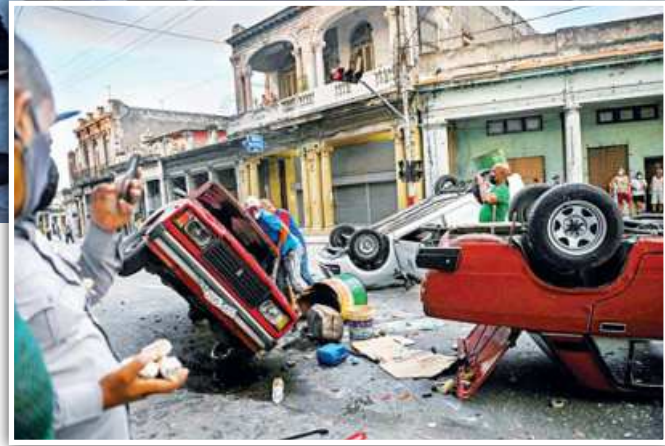
People clash with plain clothes police during protests against the government, amidst the coronavirus disease outbreak, in Havana, Cuba on Sunday. Inset, Police cars are seen overturned in a street. Chanting "freedom" and calling for the President Miguel Diaz-Canel to step down, thousands of Cubans joined street protests from Havana to Santiago on Sunday in the biggest anti-government demonstrations on the Communist-run island in decades.