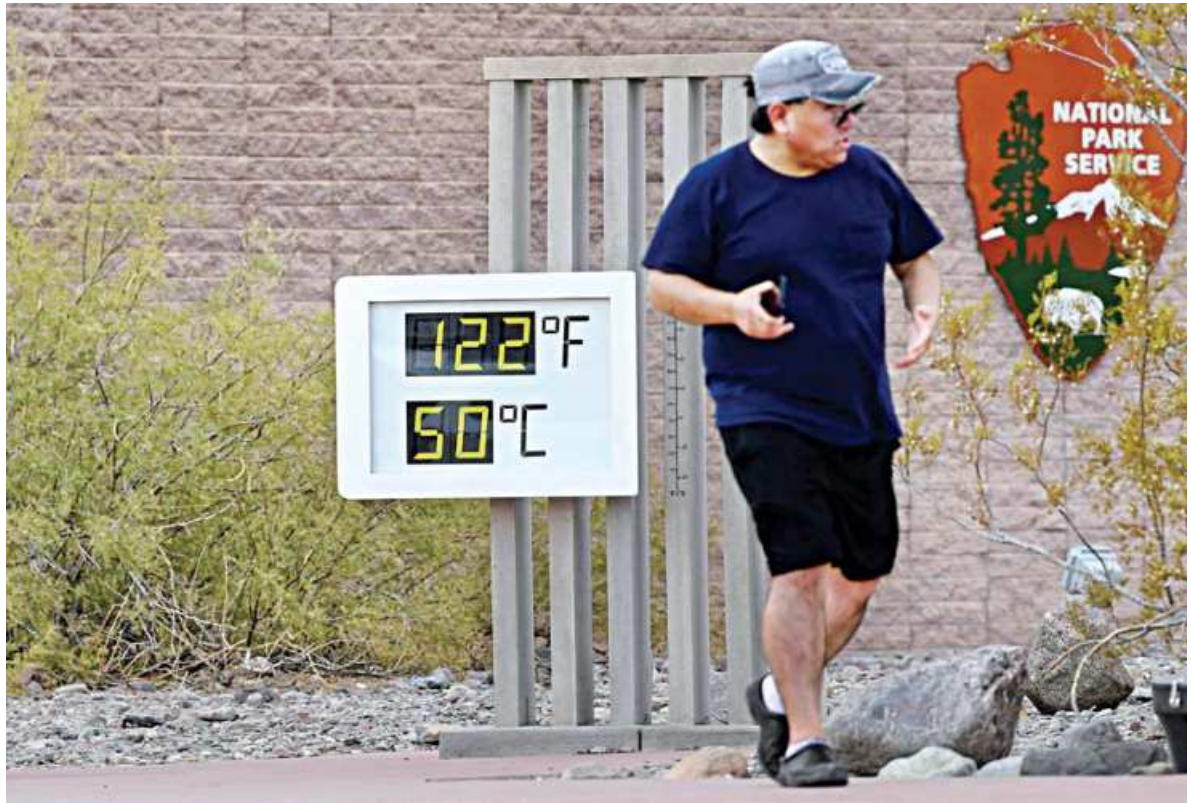
The temperature gauge at the Furnace Creek Visitors Center in Death Valley displays 125 degrees after 7pm, in California, on Sunday. Millions of people across the western United States and Canada were hit by a new round of scorching hot temperatures, with some roads closed, train traffic limited and new evacuations ordered.