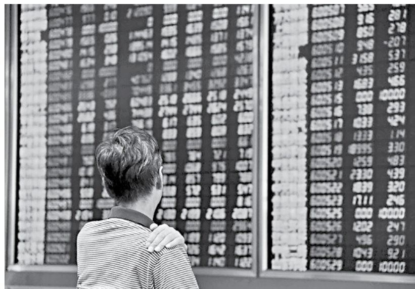
An investor looks at an electronic board showing stock information at a brokerage house in Beijing.

Commodity prices too were subdued, with Brent crude futures slipping half a per cent. London-traded copper, nickel and aluminium also fell, though China's Friday move to ease policy supported Shanghai metal futures.