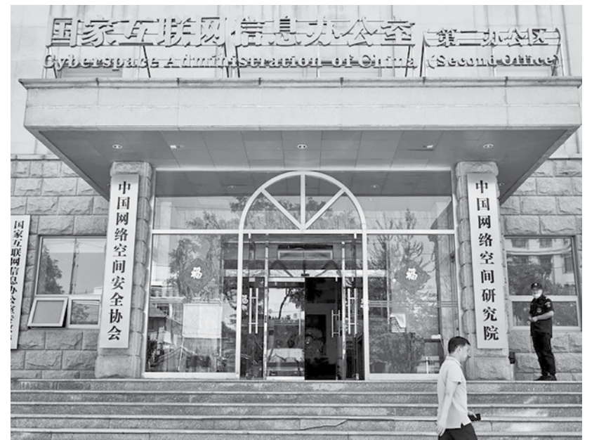
A man walks past an office of the Cyberspace Administration of China in Beijing on July 8.

On Saturday it said that any company with data of more than 1 million users must undergo a security review before listing its shares overseas.