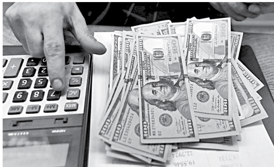
An employee counts US dollar bills at a money exchange in central Cairo, Egypt.