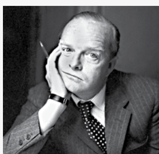
TRUMAN CAPOTE (1924–1984) American novelist

Failure is the condiment that gives success its flavor.