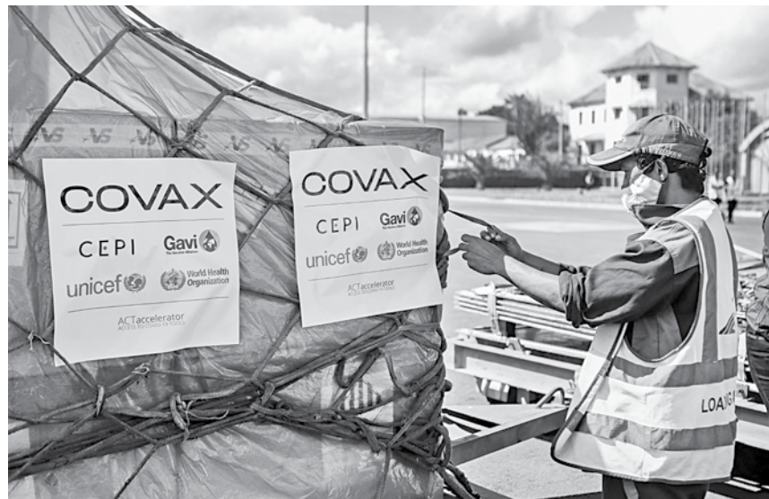
A worker handles boxes of Covid-19 vaccines, delivered as part of the COVAX equitable vaccine distribution programme, at Ivato International Airport, in Antananarivo, Madagascar, May 8, 2021.

Regional cooperation must refocus on the Sustainable Development Goals