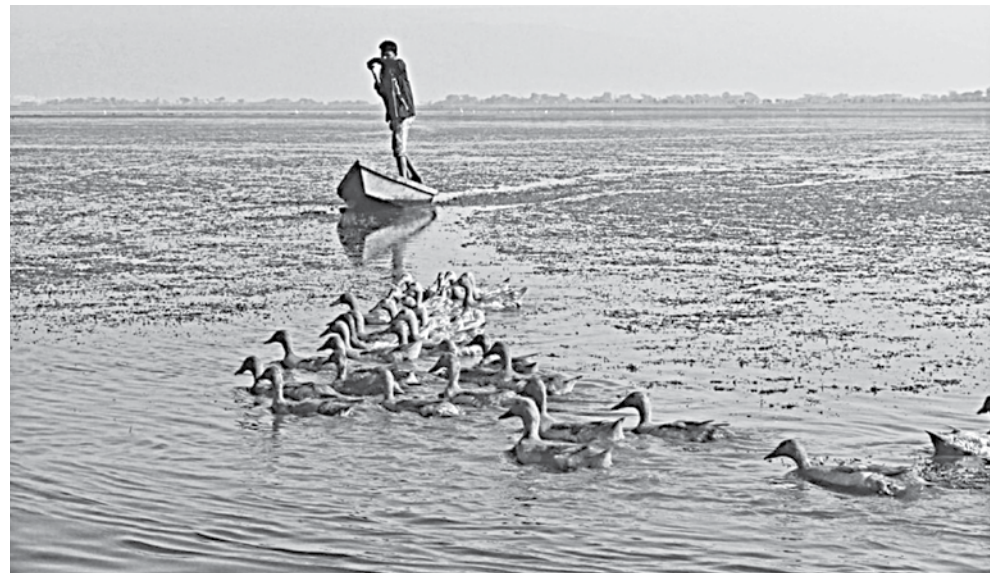
Every day, thousands of domestic ducks which are painted in different colours to easily identify their owners, enter the haor to feed and forage.