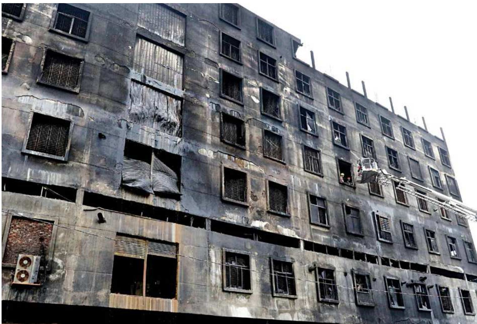
Firefighters continue rescue operation at the burnt food factory in Narayanganj's Rupganj. A devastating fire at the building left at least 51 people dead on Thursday. The fire was completely doused yesterday and no new bodies were found.