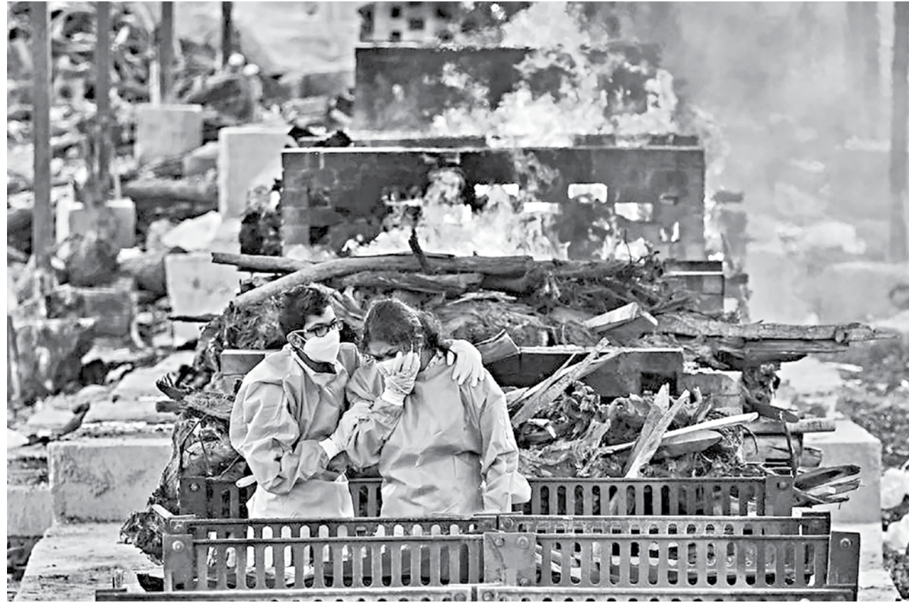
The Modi cabinet reshuffle and departure of the health minister comes in the wake of a huge public outcry against the government's handling of the second wave of Covid-19.

Pallab Bhattacharya is a special correspondent of The Daily Star. He writes from New Delhi, India.