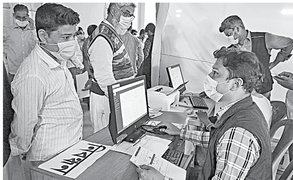
Mass vaccination remains our best chance of defeating the coronavirus.