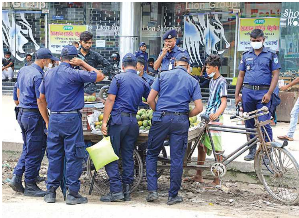
A group of police personnel surrounding a mango seller's van and bargaining for the summer fruit in the capital's Keranganj area yesterday in a way sums up the strictness of the "strict lockdown". At least seven people, including two law enforcers -- who are presumably on duty to ensure the government's stay-at-home instructions for people, can be seen in the picture without their nose and mouth covered.

Their seven-point demand includes immediate vaccination, increasing number of ICUs in the city, suspension of collecting bills and holding taxes and incentives and loans for small and medium businesses.