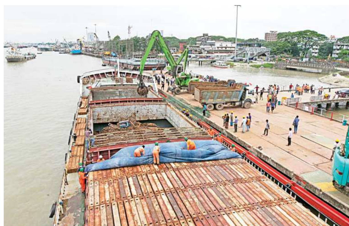
Scrap metal imported by KSRM being unloaded from a lighter at one of the four dedicated jetties constructed at Sadarghat area by Chittagong Port Authority. The photo was taken yesterday.