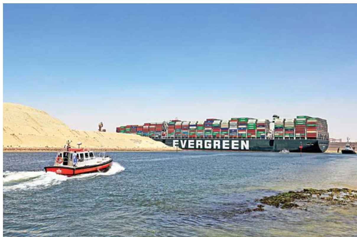
Ever Given, one of the world's largest container ships, sets sail to leave through Suez Canal after the canal authority reached a settlement with the vessel's owner and insurers, in Ismailia, Egypt, yesterday. The container ship resumed its journey to leave the Suez Canal yesterday, 106 days after becoming wedged across a southern section of the waterway for nearly a week and disrupting global trade.