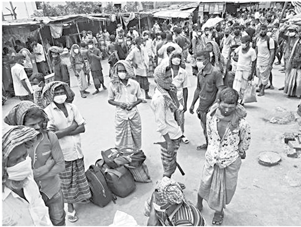
'Jon Haat' in Goalchamat area of Faridpur town where around 1,200 migrant workers have been stranded without food, work and a place to stay. The photo was taken on Saturday.