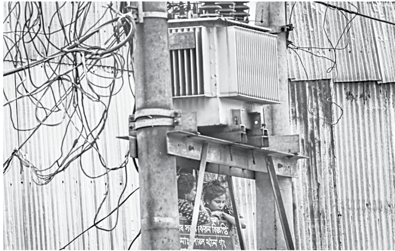
A week after the accident at Lalbagh's Islambagh that killed two people, electricity transformers in the area still sit dangerously close to residential establishments. This photo was taken yesterday.