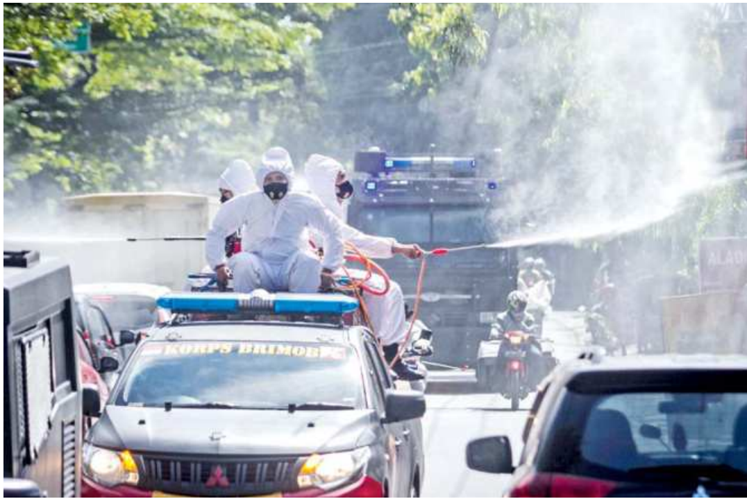
Covid-19 Taskforce officers wearing personal protective equipment (PPE) spray disinfectant on the road to prevent the spread of the coronavirus disease in Solo, Central Java Province, Indonesia yesterday.

Sumi urged the government to provide loans at a low interest rate to small vermicompost entrepreneurs so they are able to expand their businesses.