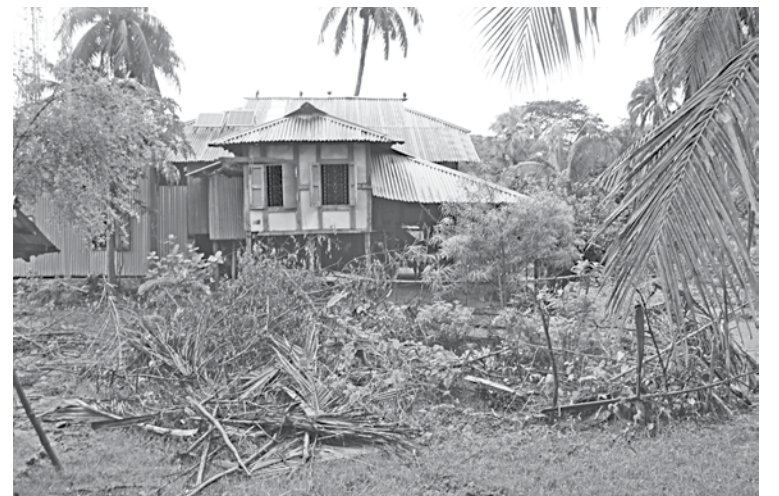
A view of the Rakhine village of 'Chaanipara' in Kalapara's Tiakhali area.

"I have heard their demands which are very logical. They will get the compensation soon. And they will be rehabilitated wherever they want. However, as long as the rehabilitation cannot be done, they will be able to stay in the place of their choice. If necessary, the rent will be borne by the port