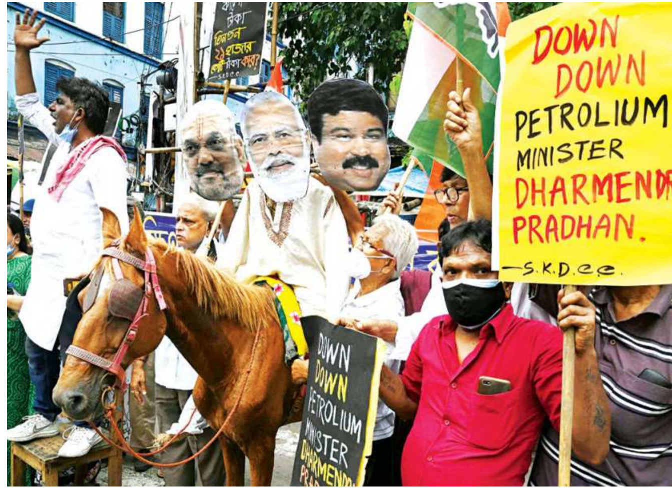
Congress Party activists shout slogans next to an effigy of Indian Prime Minister Narendra Modi (C), Home Minister Amit Shah (L) and Minister for Petroleum and Natural Gas and Steel Dharmendra Pradhan during a protest against the recent hike of fuel in Kolkata, India yesterday.

An Antonov-28, a similar plane, slammed into a Kamchatka forest in 2012 in a crash that killed 10 people along the same route. Investigators said both pilots were drunk at the time of the crash.