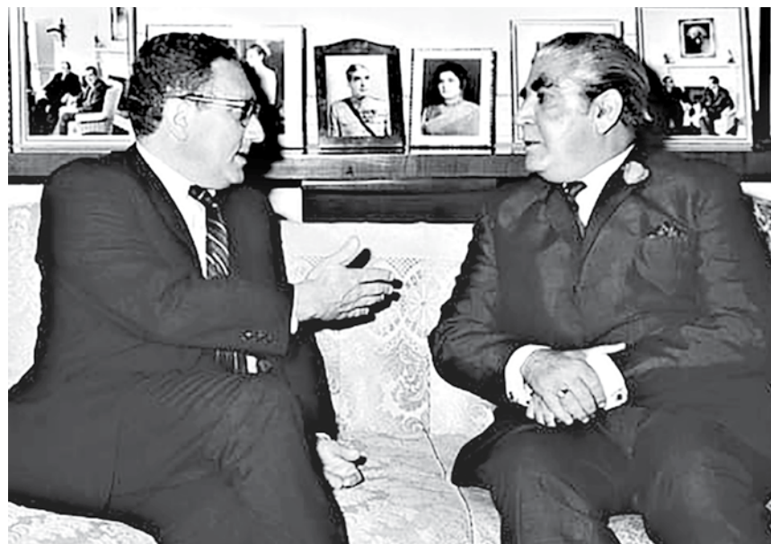
Henry Kissinger with President Yahya Khan in Rawalpindi, Pakistan.

From New Delhi, Kissinger went on to Islamabad. Though he gave the impression that he and Yahya Khan would discuss the Bangladesh issue, that was a farce. On July 8, he had dinner with Yahya, where Kissinger apparently told him that for a dictator, he ran a lousy election. After dinner, false information was spread that Kissinger had fallen ill and doctors had