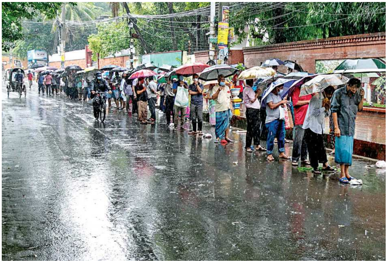
Amid heavy rain, people queue up and wait for a TCB truck so that they can buy essentials at reduced prices. After a few days break, the Trading Corporation of Bangladesh (TCB) started selling essential commodities from their trucks. The photo was taken in Chattogram city's Jamal Khan area around noon yesterday.