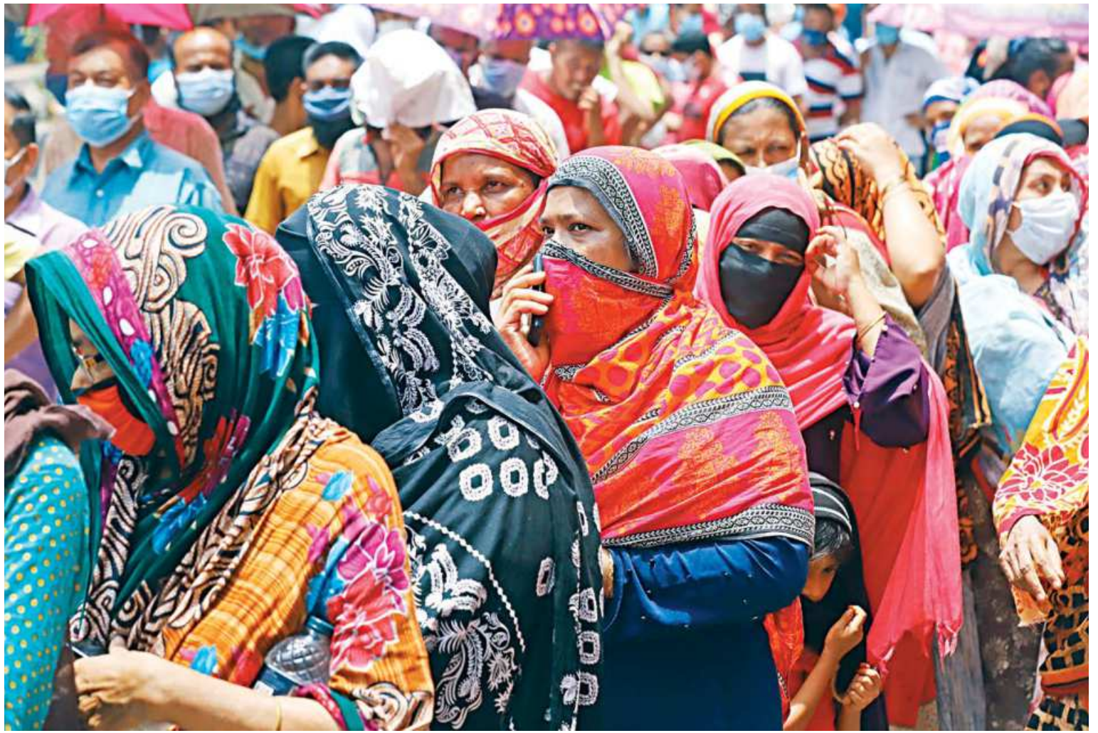
HUNGER HITS HARDER THAN FEAR ... With Trading Corporation of Bangladesh resuming their fair-price sales of essentials across the country, low-income people -- who have been hit hardest economically because of the lockdown -- are flocking to the TCB trucks to get the best value for money. Social distancing was the furthest thought on their mind as hundreds waited in jam-packed lines in the capital's DIT Road yesterday.