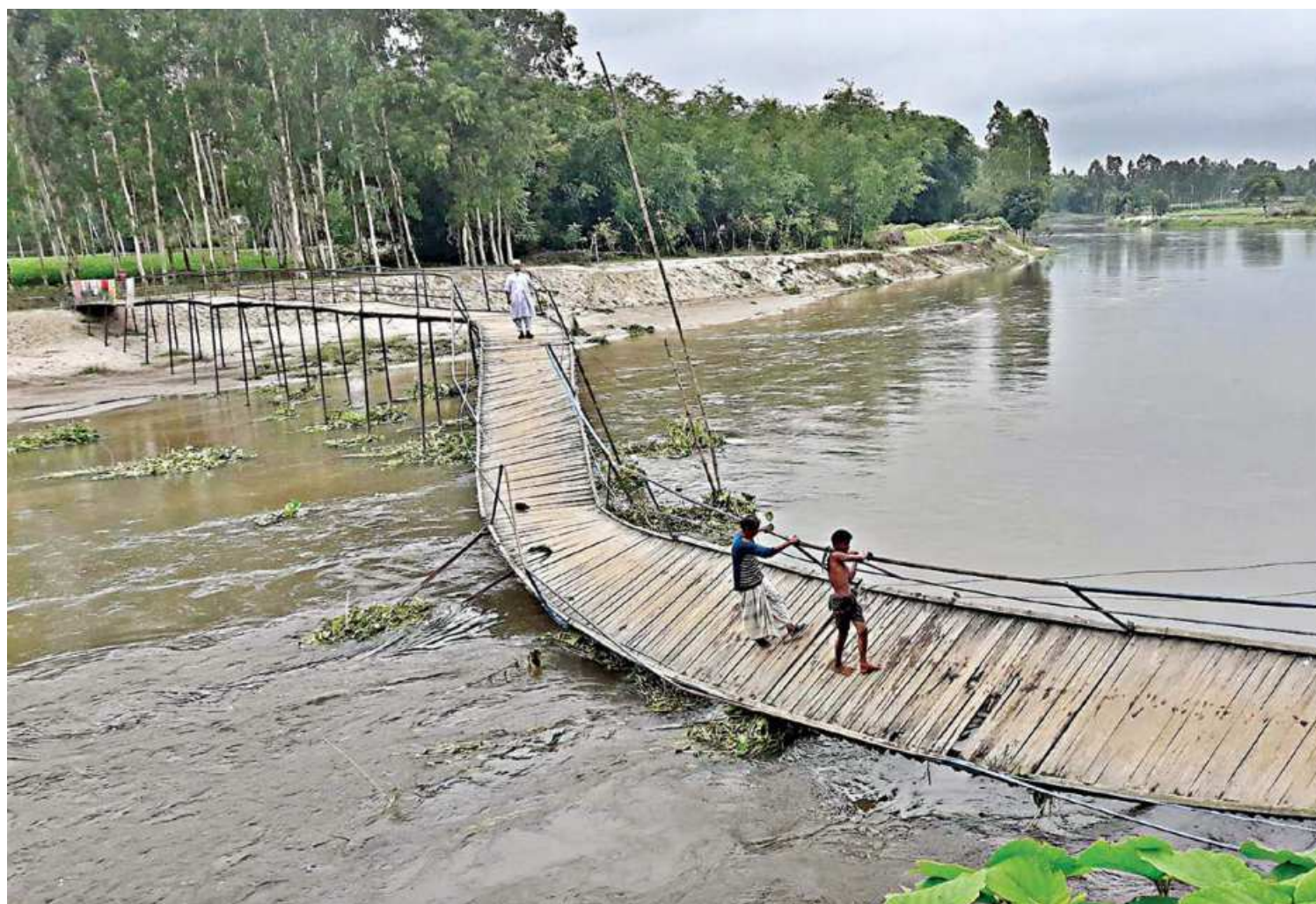
People of 10 villages of Satmera union in Panchagarh's Sadar upazila suffering immensely as a wooden bridge that is regularly used by the villagers partially collapsed last Saturday due to heavy flow of water.