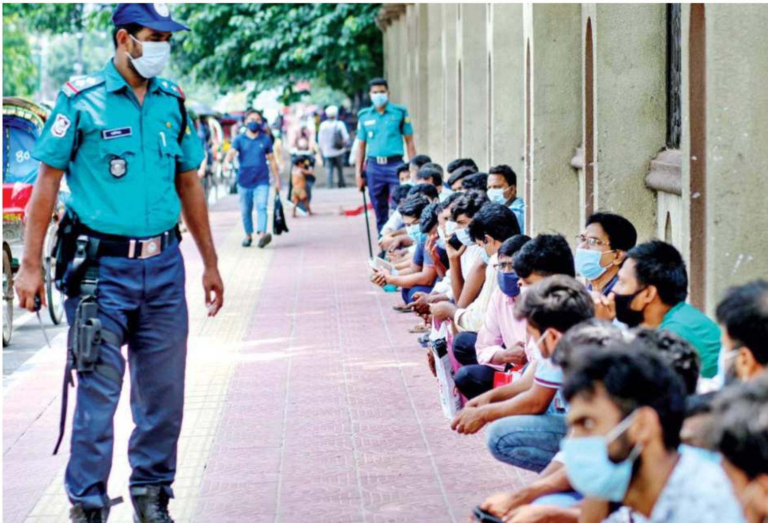
Police detain people in front of the Rajuk Bhaban in the capital's Dilkusha yesterday for violating "strict lockdown" rules. The detainees could not give valid reasons for being out. Law enforcers made them aware of complying with the rules before releasing them on assurance that they won't flout the rules again.