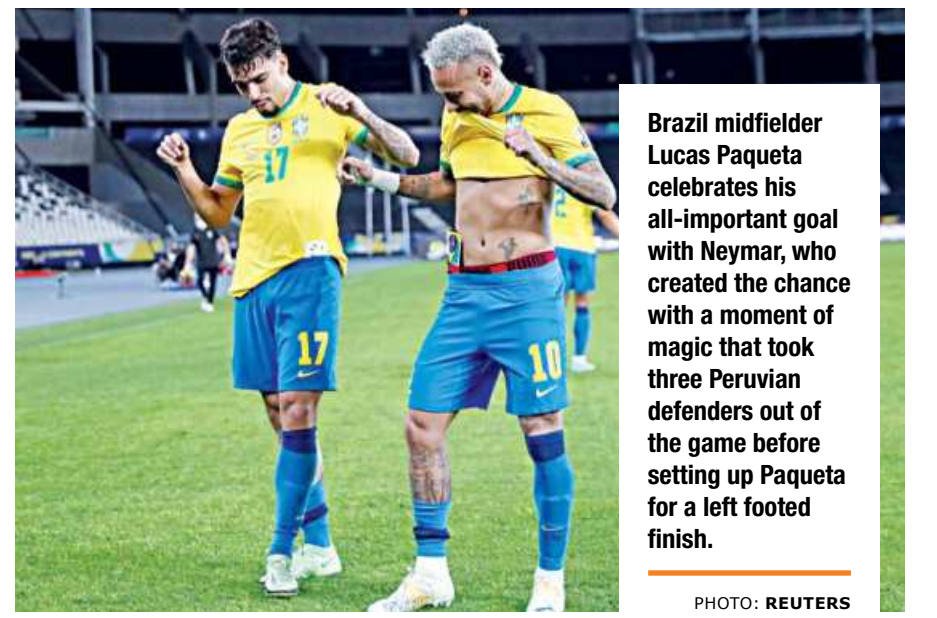
Brazil midfielder Lucas Paqueta celebrates his all-important goal with Neymar, who created the chance with a moment of magic that took three Peruvian defenders out of the game before setting up Paqueta for a left footed finish.

Both players have had an exceptional tournament so far, with Neymar recording two goals and three assists, while Messi has four goals and four assists.