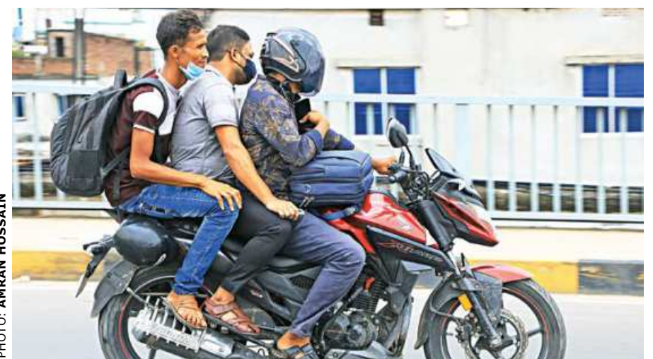
Carrying passengers on motorbikes is prohibited during the lockdown, but these two sitting on the back were going to Mawa from Sonir Akhra yesterday. This was not an isolated case. Many are hiring bikes for up to thrice the regular fare to go to village homes ahead of Eid. The two had paid Tk 1,200 for the rather risky ride.