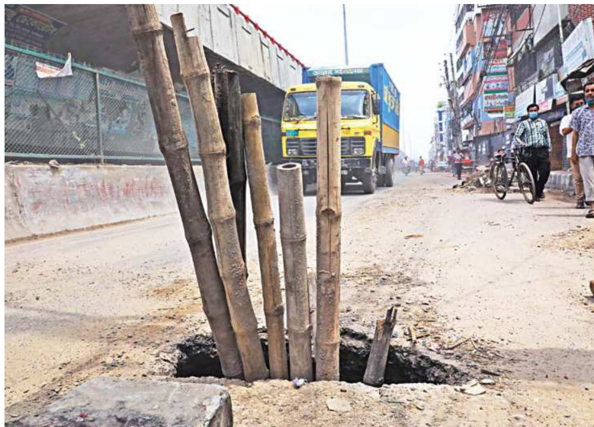
Bamboos protrude out of a gap on a major thoroughfare in the capital's Jatrabari, that sees heavy vehicle traffic ply. These have been here apparently for weeks, according to locals. The photo was taken yesterday.

Police filed a case against unidentified people for deaths caused due to negligence on Tuesday but none were arrested yet. Counter Terrorism and Transnational Crime unit of DMP is now investigating the case.