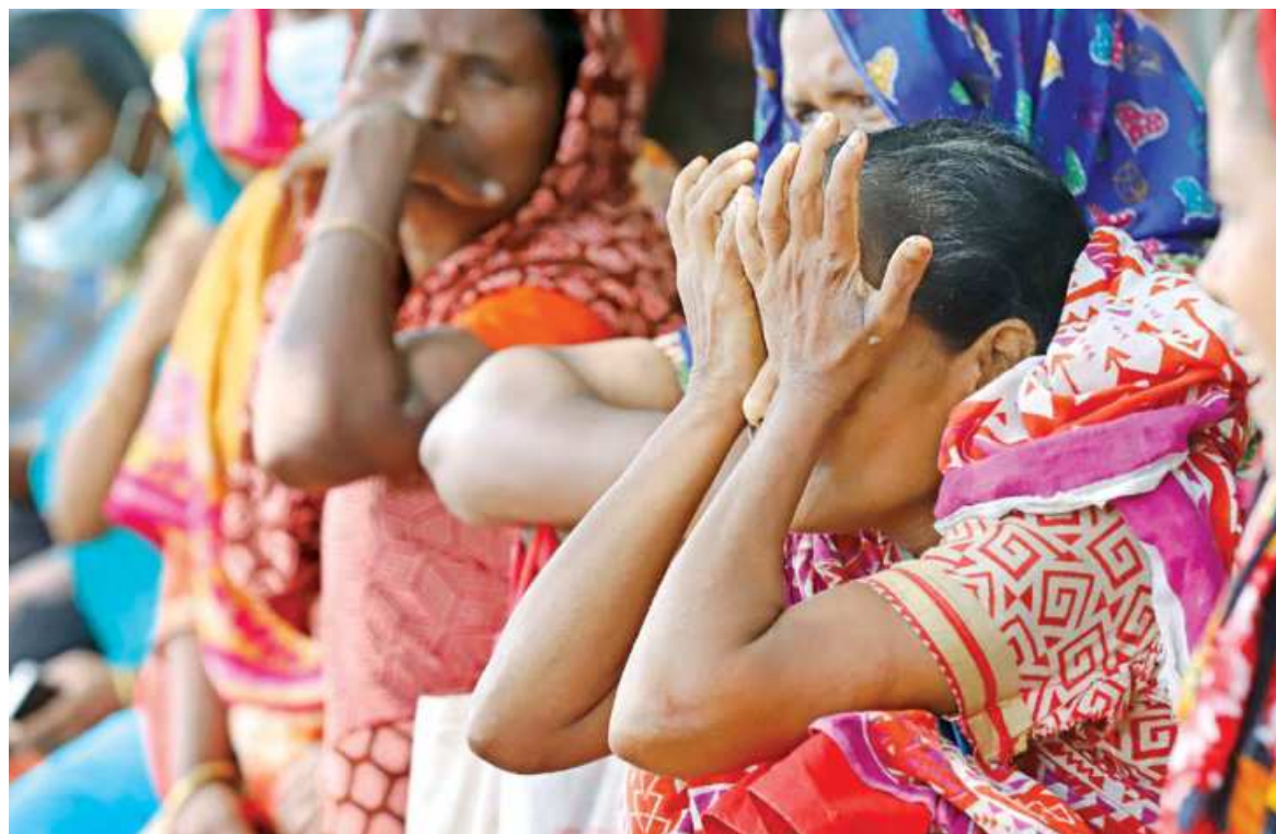
Construction workers wait for work in the capital's Baridhara around noon on Monday. They come to this area early morning every day, but hardly find any work amid the ongoing "strict lockdown". The workers are now struggling to make ends meet.

The government decided to vaccinate Saudi Arabia and Kuwait bound migrant workers with Pfizer shots as it is one of the four vaccines approved in the Middle East countries.