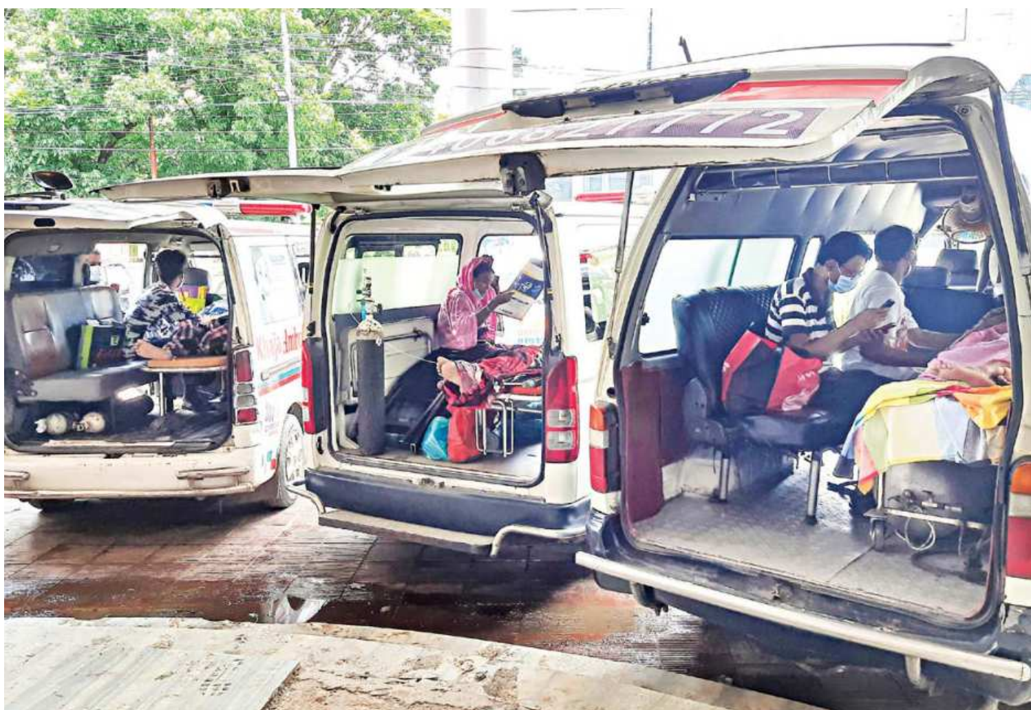
Patients wait in three ambulances for hours outside Khulna Medical College Hospital yesterday to get admitted. The 130-bed Corona unit of the hospital is already well beyond capacity as the Khulna division sees a huge surge in Covid-19 cases.