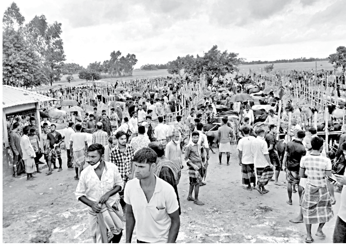
Without any member of law enforcers or the local administration in sight, not even a single person was found to be wearing a face mask properly in this jam-packed market of sacrificial animals in Janatbazar area under Nabiganj upazila of Habiganj. The photo was taken on Saturday.