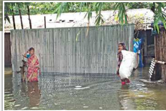
People in Rangpur's Gangachara upazila are having to use boats as transport due to the floods caused by the swelling of the Teesta. Around 4,500 families of different char areas in the upazila have been marooned as an embankment on the river washed away. Many families have even resorted to boats as shelters. The photo was taken recently at Pashchim Ichli of Gangachara.