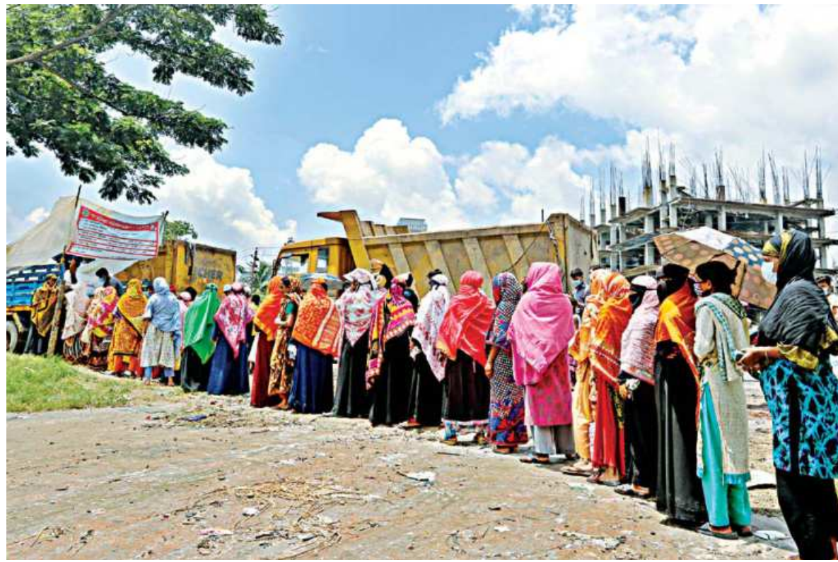
A long queue of mostly women waiting behind a mobile shop of Trading Corporation of Bangladesh selling daily essentials in Jatrabari in the capital. The corporation started selling groceries yesterday to help residents amid the lockdown.